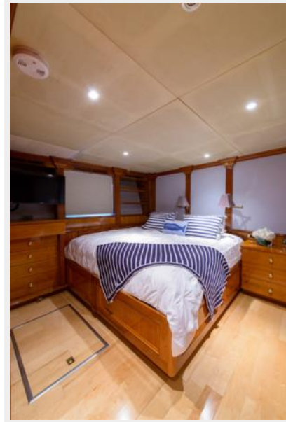
Port Guest Stateroom