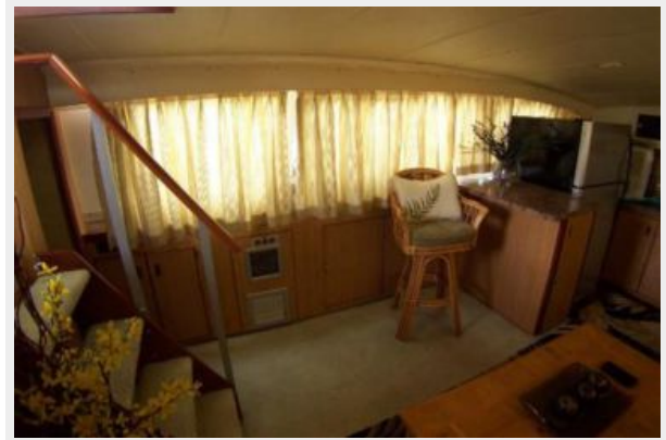
Salon to port