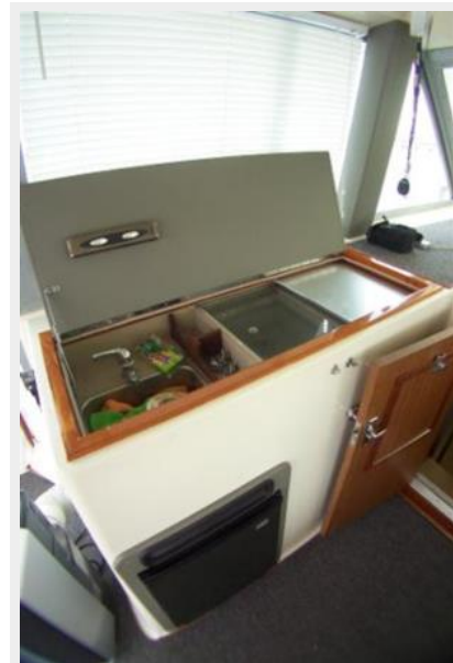
Flushdeck Wet Bar, Refrigerator