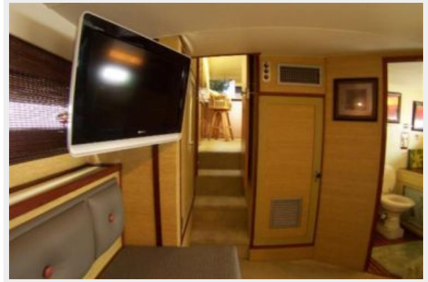
Passageway to forward Guest Quarters