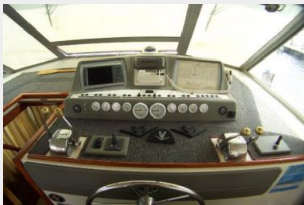
Lower Helm Instruments