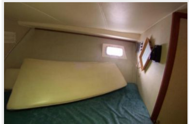
V-berth to starboard