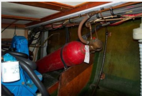
Engine Room-outboard, port