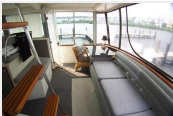
Flushdeck to stbd