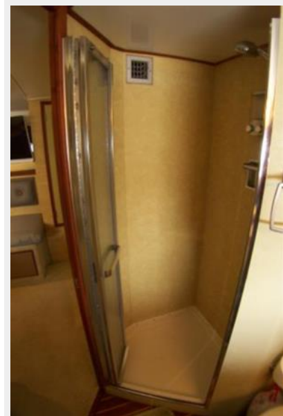
MSR Shower in Head