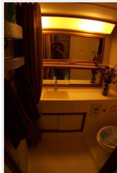
Guest Head - forward