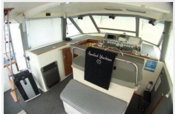
Lower Helm - forward port