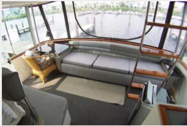
Flushdeck aft Seating