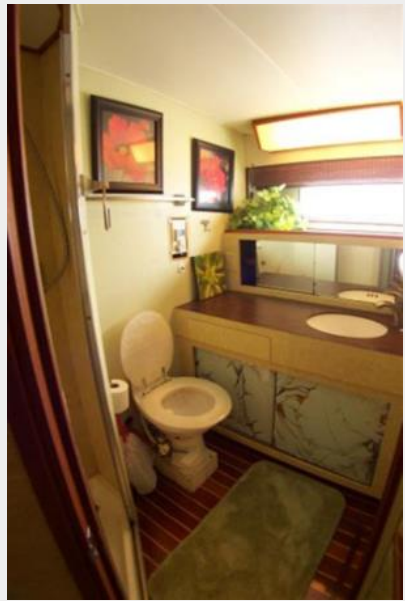
Master Ensuite Head