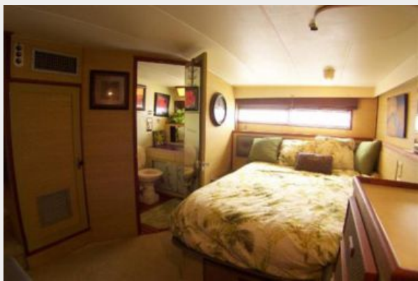
MSR to starboard