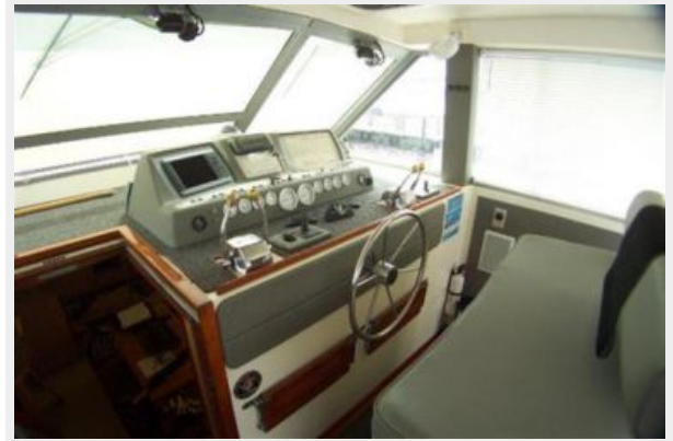
Lower Helm in Flushdeck