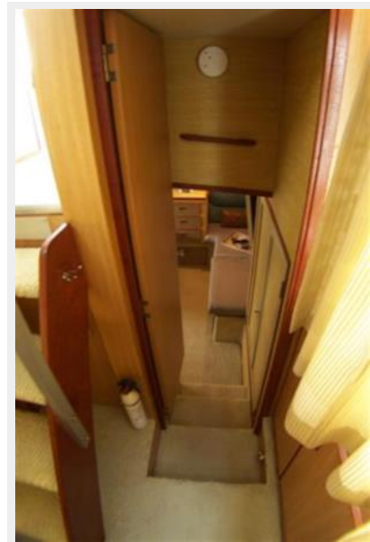
Passageway to Master Stateroom