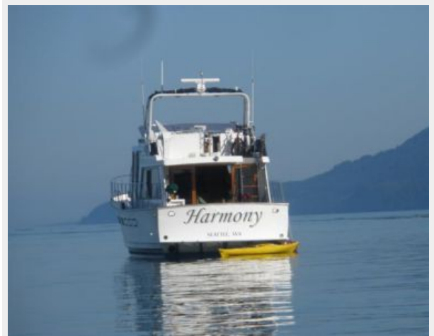
At Anchor for Kayaking