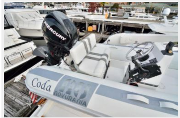
40hp Mercury OB