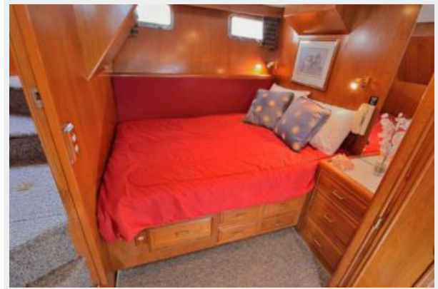
Guest Stateroom Double