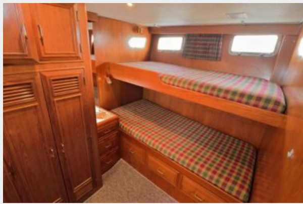
Guest Stateroom Bunks