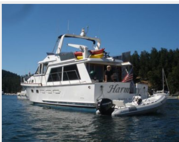
Moored in Reid Harbor, Stuart Island