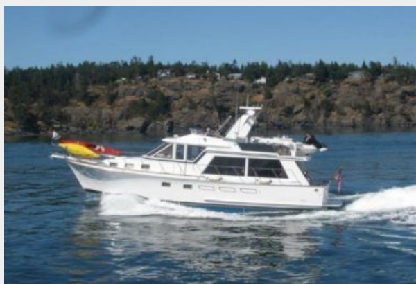
Accelerating Onto Plane