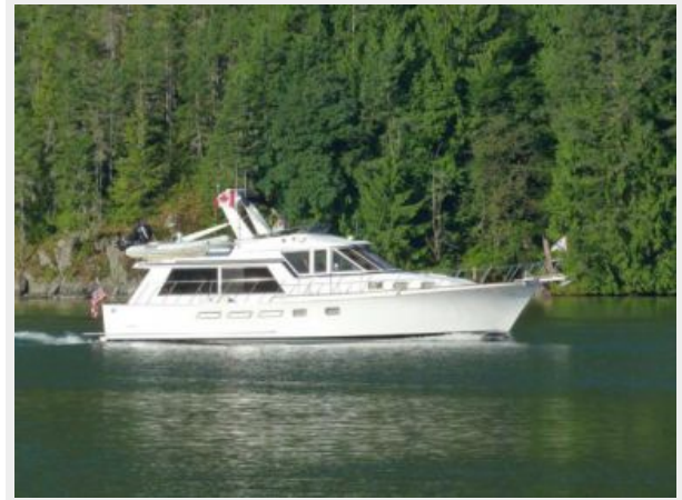
Relaxing, economy cruise