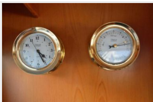
Clock & Barometer