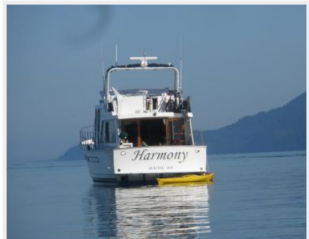
At Anchor for Kayaking