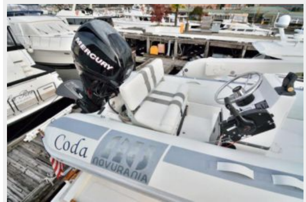
40hp Mercury OB