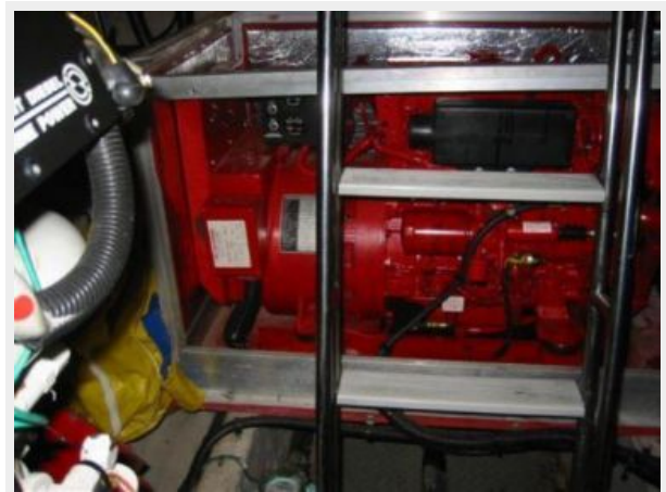
1996 50 Sea Ray in heated Storage in Buffalo, NY