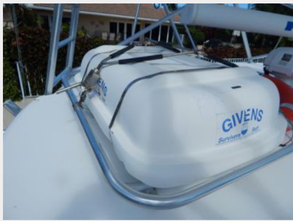
Givens Life Raft