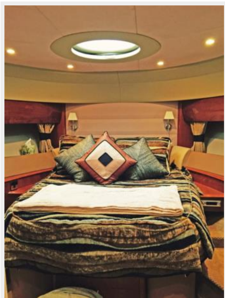
VIP Forward Stateroom