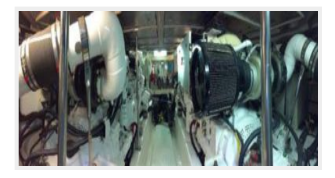
Engine Room Looking fwd