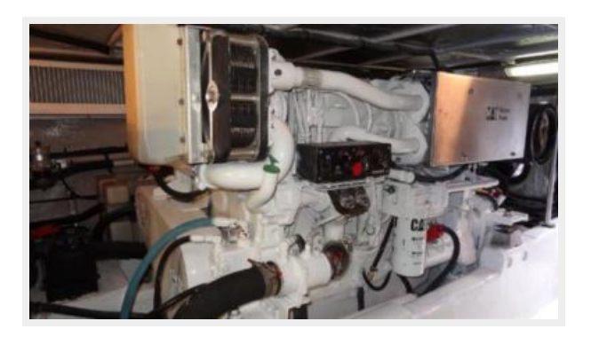
Port 3406E CAT Engine