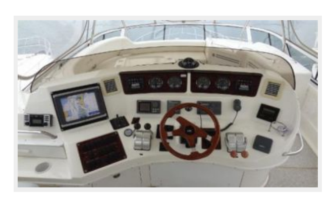
New Lebroc Helm Seats