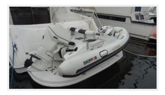
GHS Hydraulic Swim platform