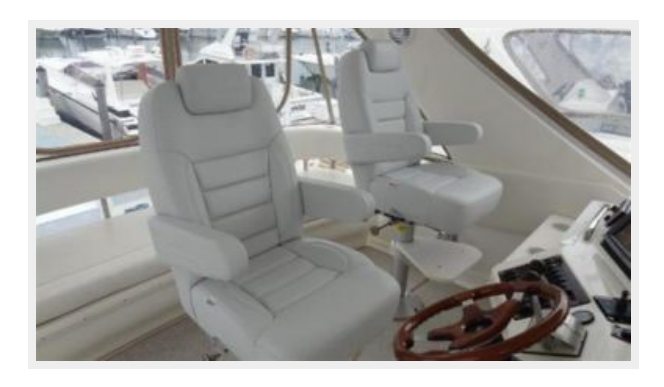
Bow & Stern Thruster