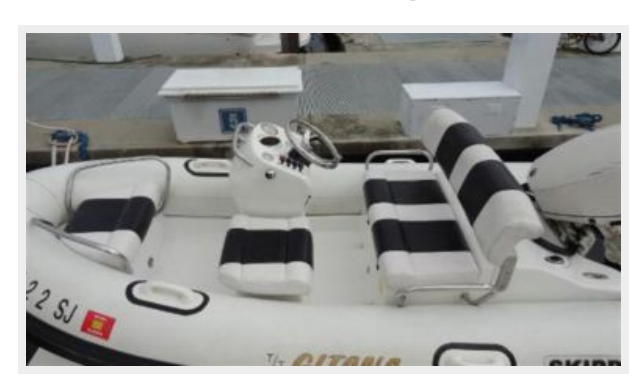
2013 Tender w/30hp E-Tec