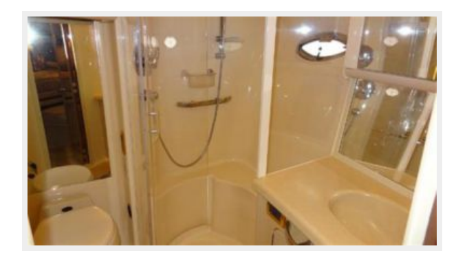
Cabin 3 Custom Mounted TV