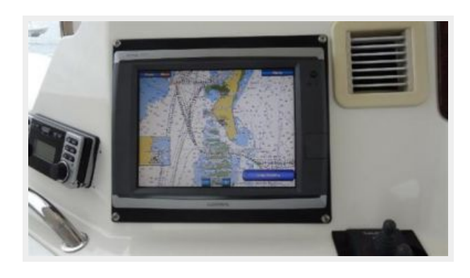
New Garmin 5212