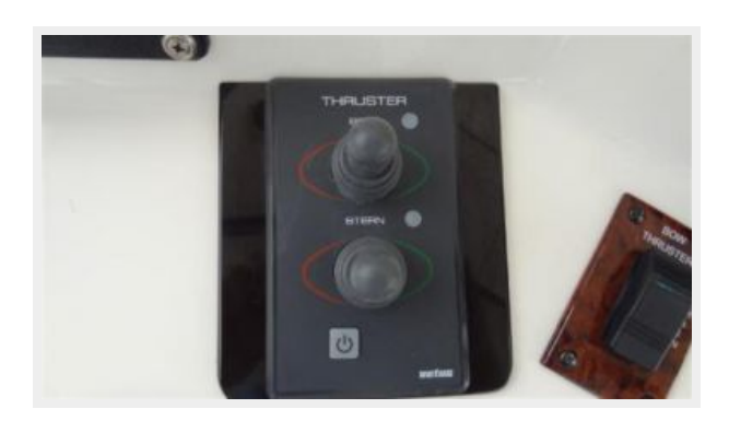
New Garmin 7212