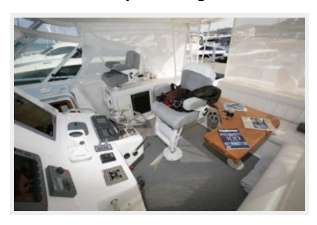
Cockpit Seating Aft