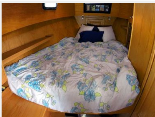
North Shore 34 Master Stateroom Berth