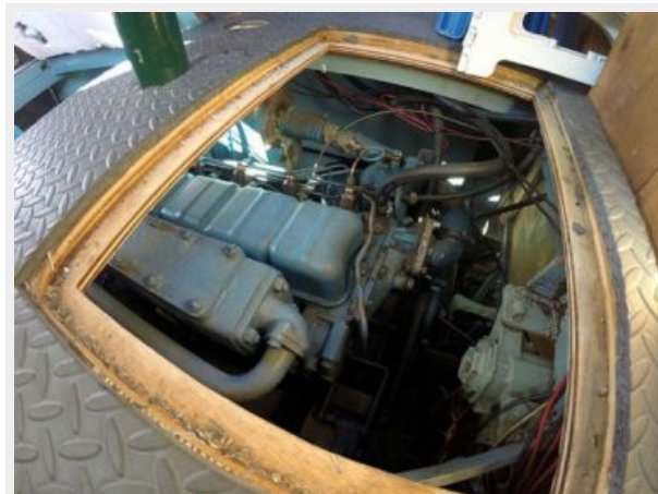
North Shore 34 Main Engine Photo1