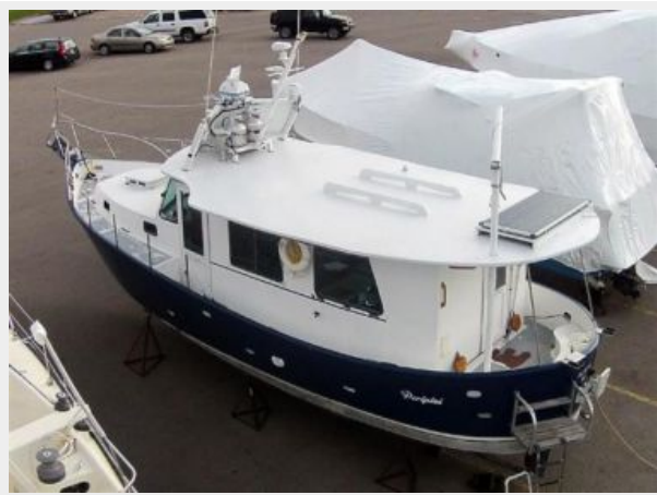
North Shore 34 Port Aft Overhead Profile