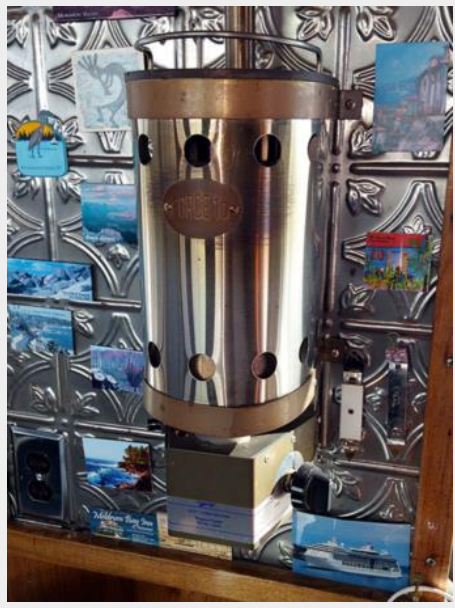
North Shore 34 Gas Heater