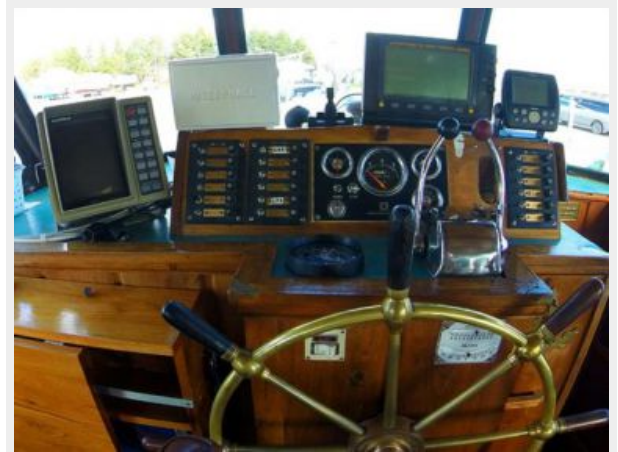
North Shore 34 Helm