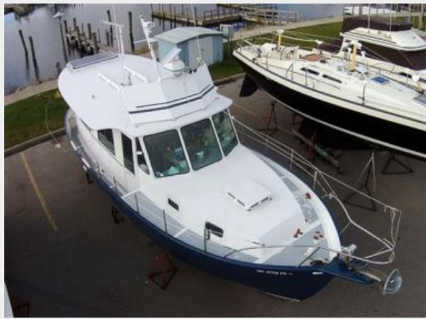
North Shore 34 Starboard Forward Overhead Profile