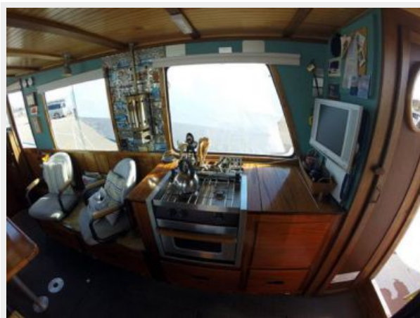
North Shore 34 Starboard Starboard