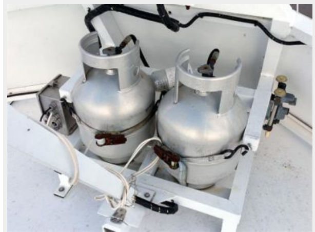
North Shore 34 Propane Storage