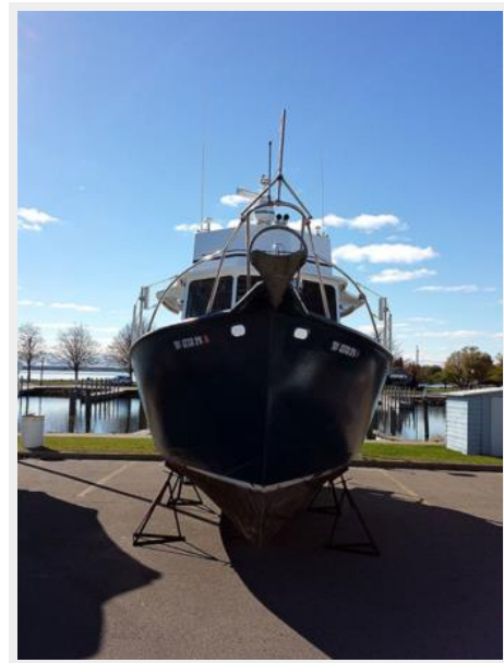
North Shore 34 Forward Profile