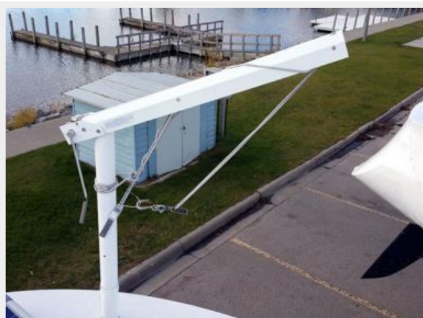
North Shore 34 Tender Davit