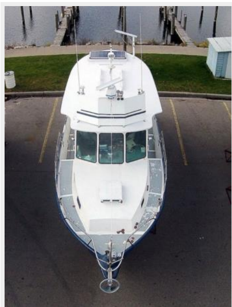
North Shore 34 Forward Overhead Profile