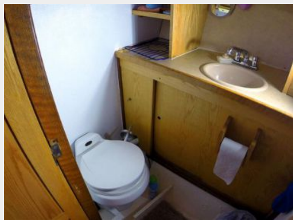
North Shore 34 Head