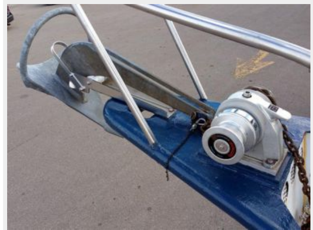
North Shore 34 Bow Pulpit