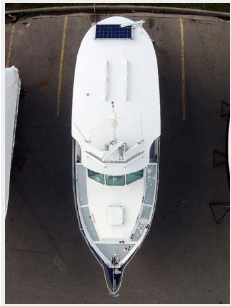
North Shore 34 Overhead Profile