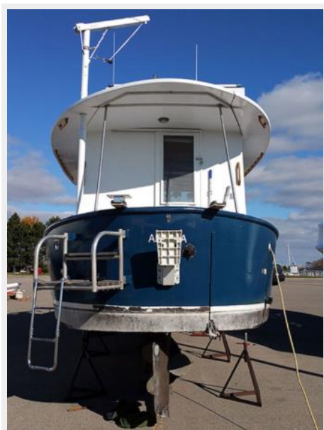
North Shore 34 Aft Profile