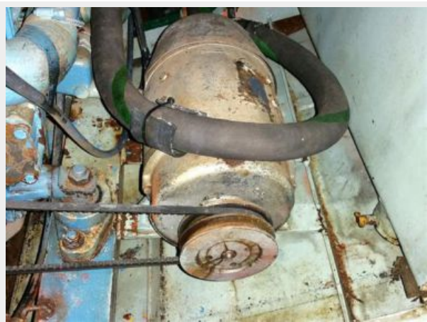
North Shore 34 Power Generator