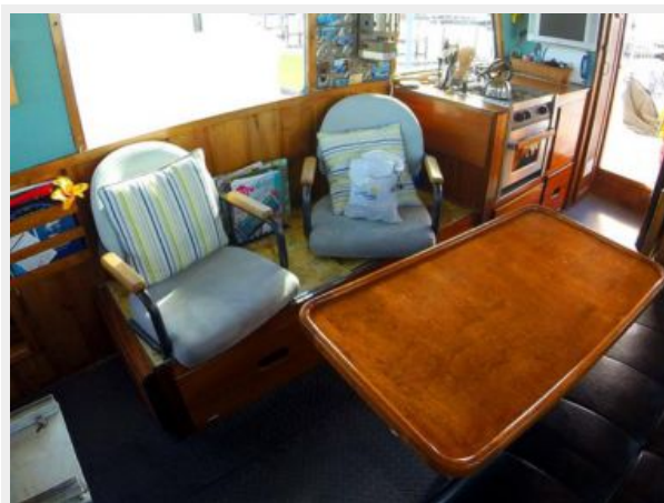
North Shore 34 Salon Starboard Seating