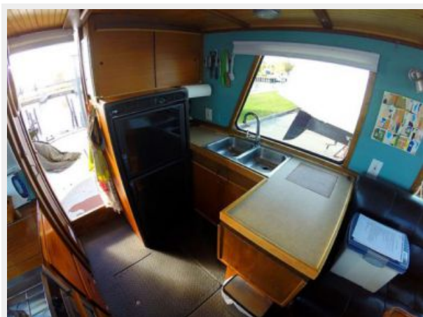
North Shore 34 Galley Port