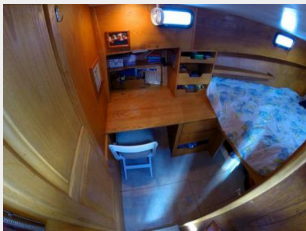
North Shore 34 Master Stateroom