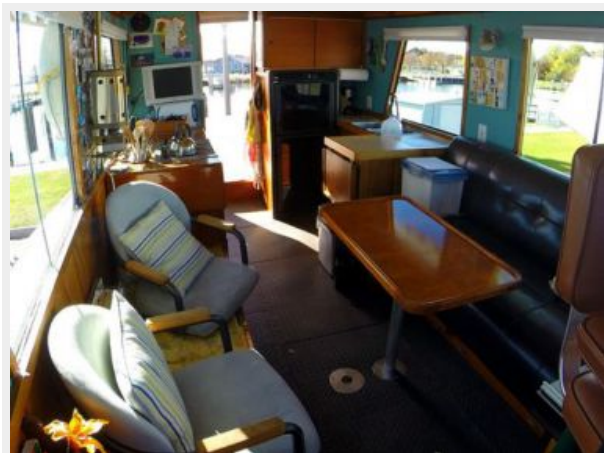
North Shore 34 Salon Aft