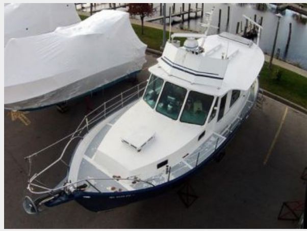
North Shore 34 Port Forward Overhead