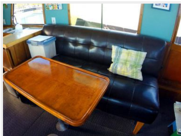
North Shore 34 Salon Sofa/Sleeper