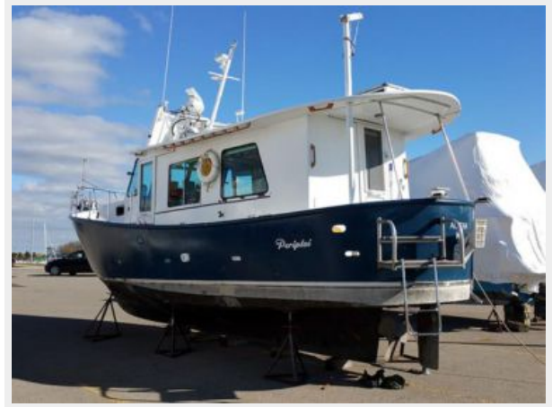
North Shore 34 Port Aft Profile