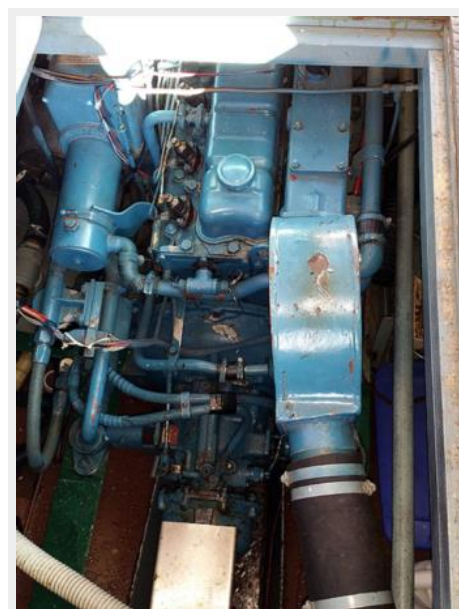
North Shore 34 Main Engine Photo1