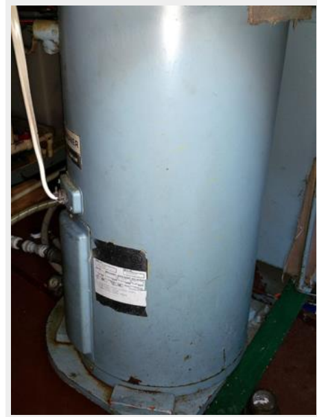
North Shore 34 Water Heater