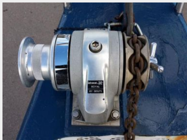
North Shore 34 Anchor Windlass