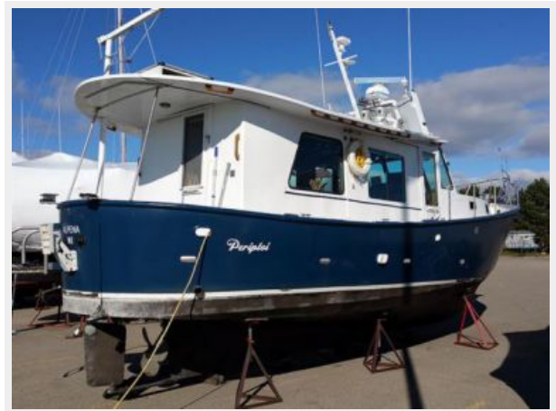
North Shore 34 Starboard Aft Profile