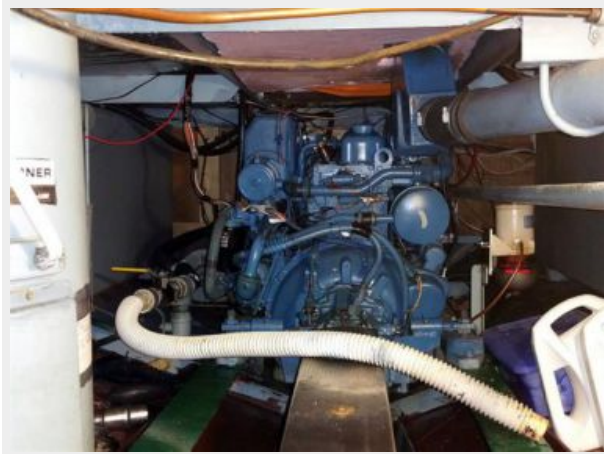
North Shore 34 Main Engine Photo2