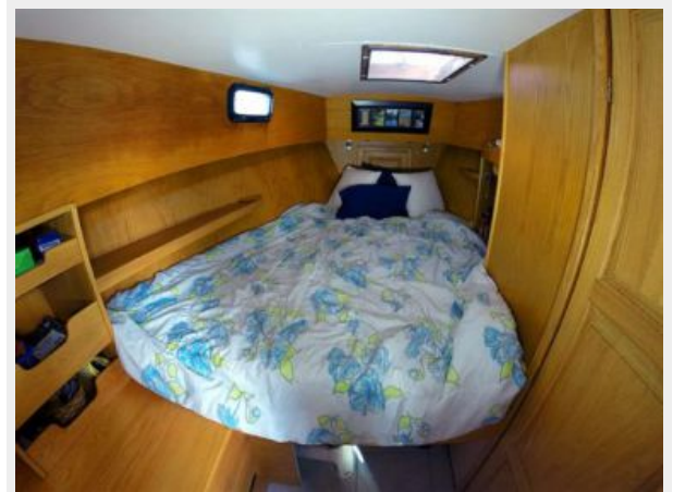
North Shore 34 Master Stateroom Port