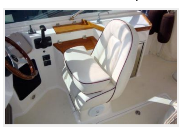
Helm Chair, Bolster Up