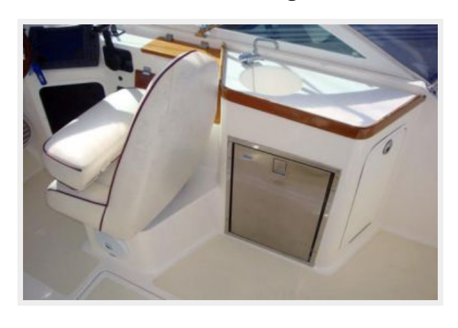
Wet Bar and Refrigerator