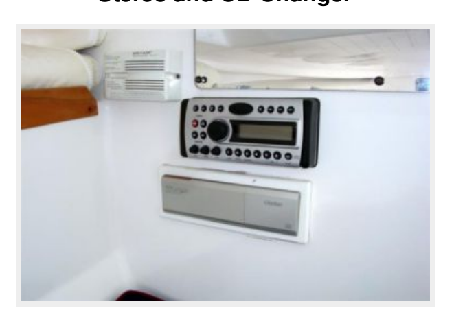
Stereo and CD Changer