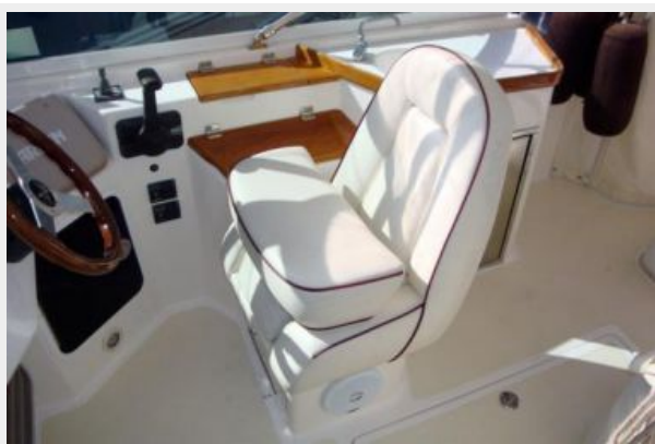
Helm Chair, Bolster Up