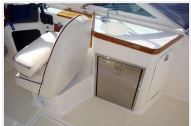
Wet Bar and Refrigerator