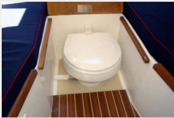
VacuFlush Fresh Water Head