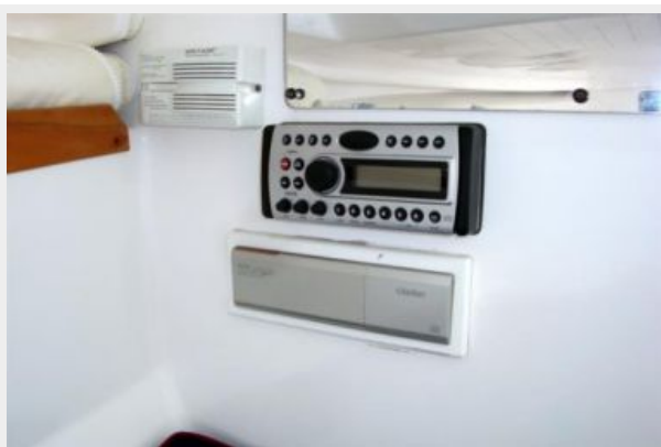
Stereo and CD Changer