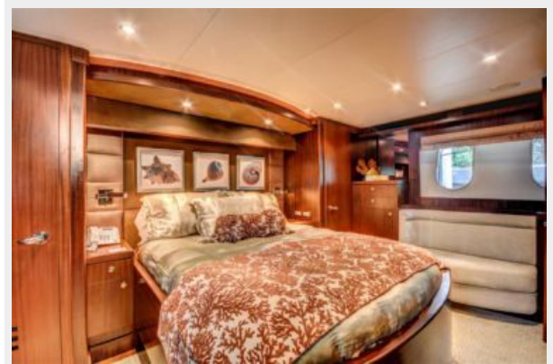
Queen Guest Stateroom, Midship