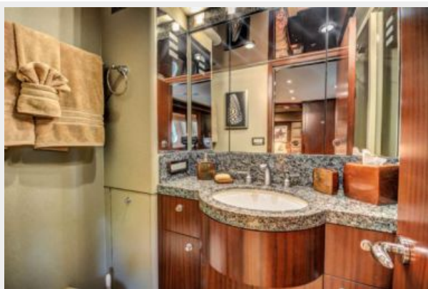
Queen Guest Bath