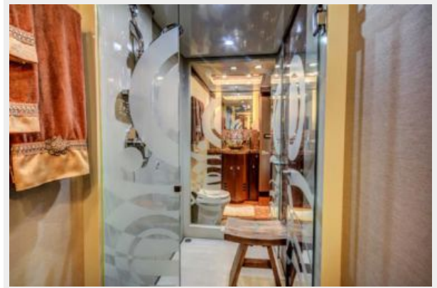
Master Bath Shower