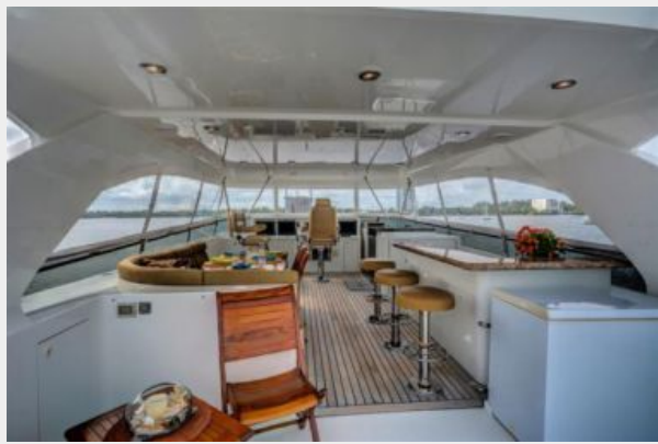
Flybridge Deck, Aft & Tender