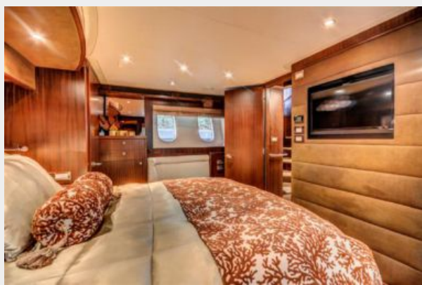
Queen Guest Stateroom, Midship