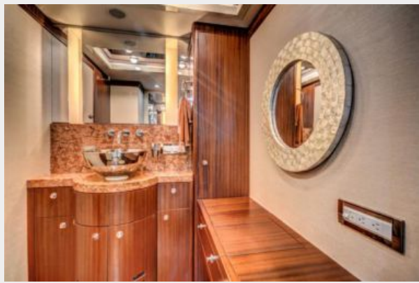
Master Bath Shower