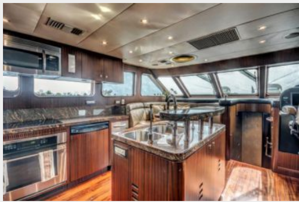
Galley / Dinette / Pilothouse