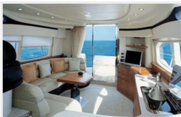
Twin Cabin