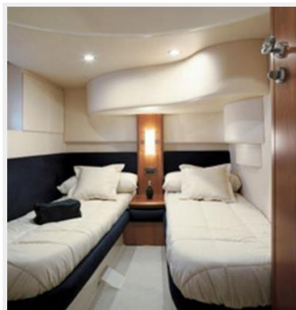
Manufacturer Provided Image: Twin Cabin