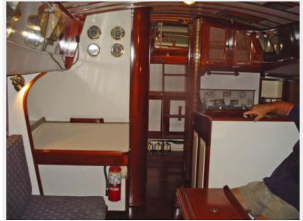
Main Salon looking aft to Aft Cabin and Companionway