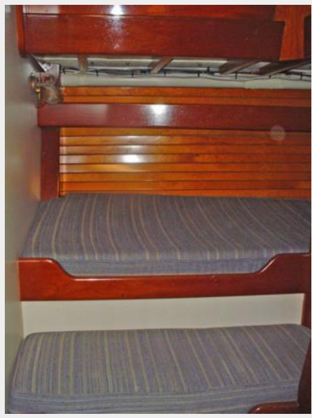
Aft Cabin Starboard (2) Single Berths