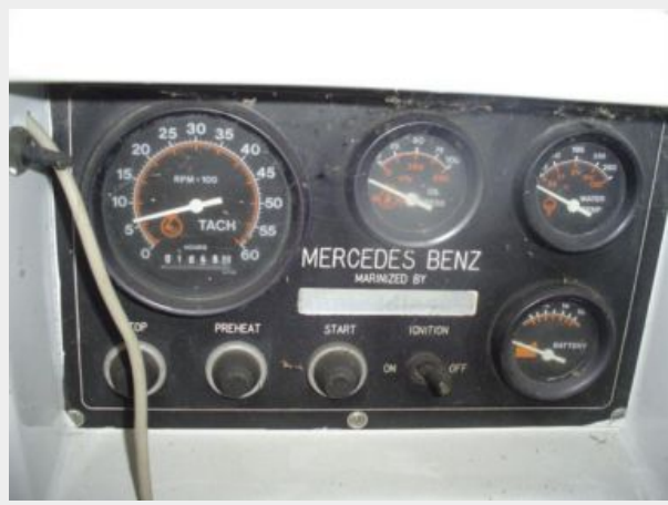
Cockpit Engine Gauges/Start Switch