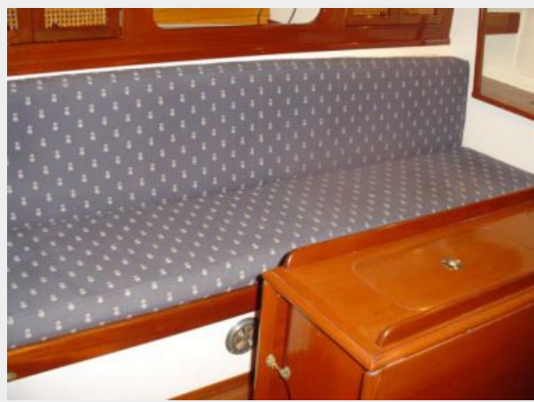
Main Salon Port Settee w/Fold down Dining Table