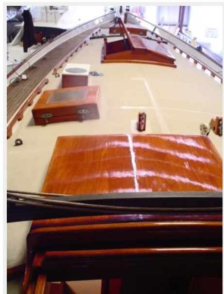
Top Deck Forward from Cockpit