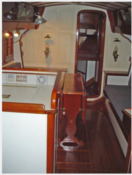
Main Salon looking forward from Galley