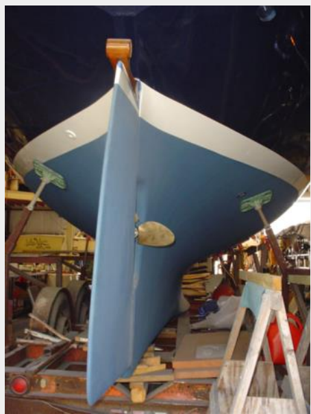
Rudder and Scheel Keel