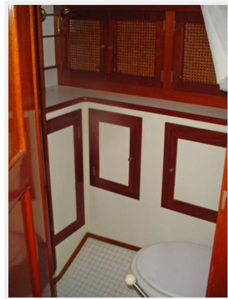
Head with NEW Manual Toilet & NEW Holding Tank