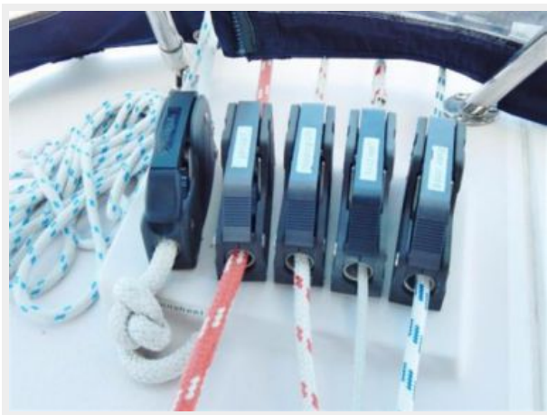
Rope Clutches Port