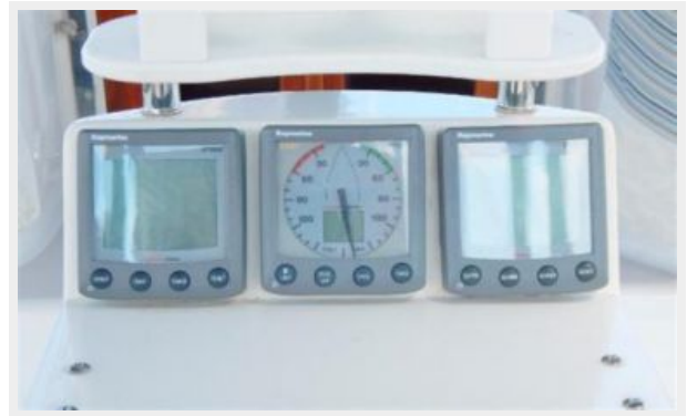
Speed, Depth, Wind