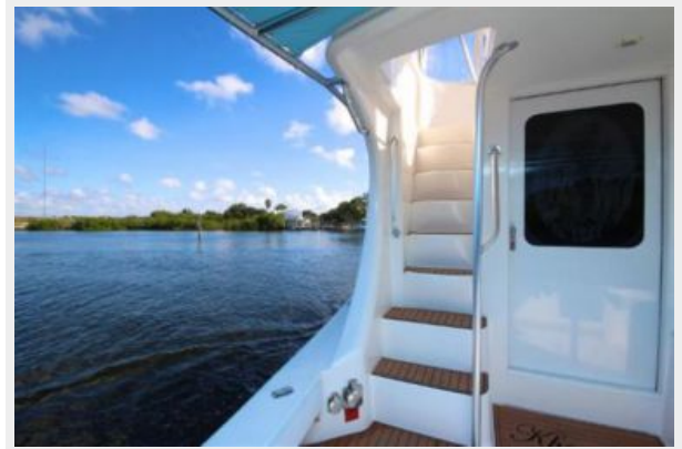
Steps To Fly Bridge