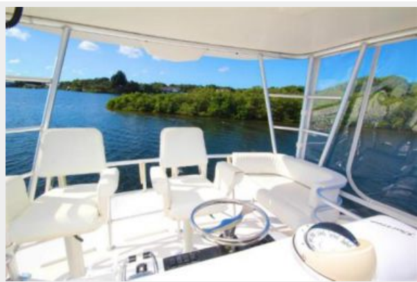
Fly Bridge 3