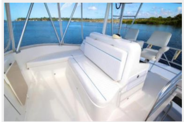
Fly Bridge 2