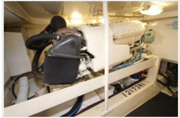
Port Engine 1