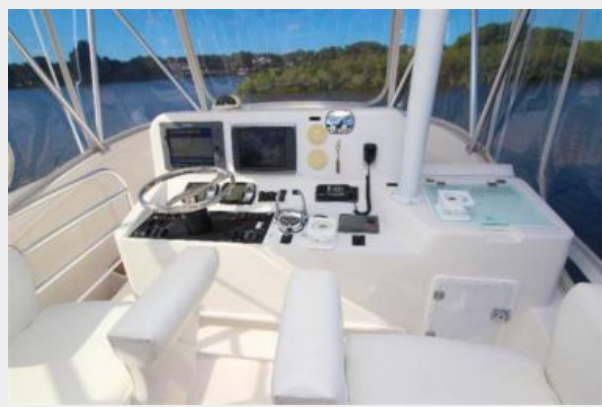
Fly Bridge 1