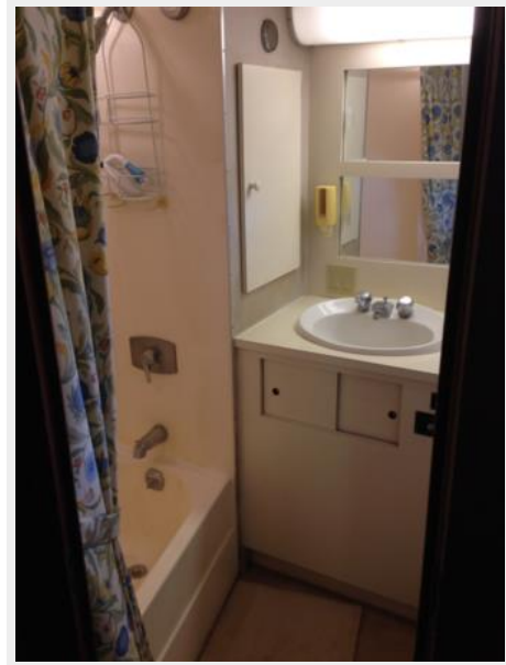
Guest Stateroom #1