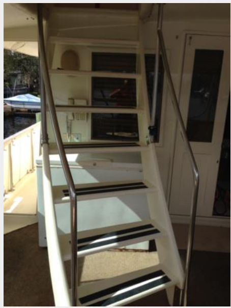
Aft Deck Staircase to Bridgedeck