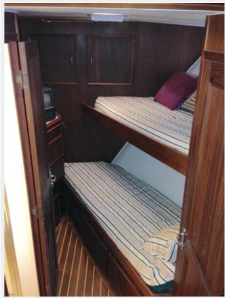
Bow Guest Stateroom #2