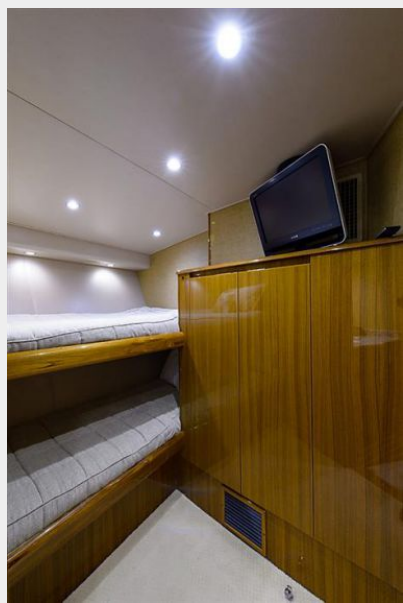
Forward Port Guest Stateroom