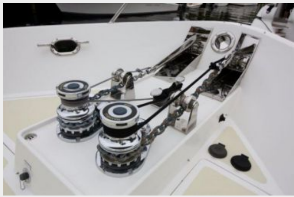
Dual upgrated Anchors