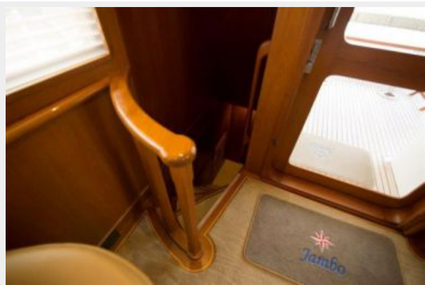
Stairs to Crew and Engine Room