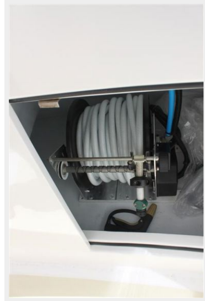
SS Hose reel