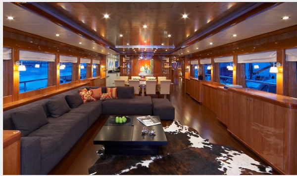
Salon looking forward