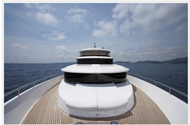
Standard teak decks