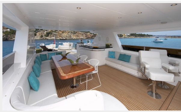
Flybridge looking aft