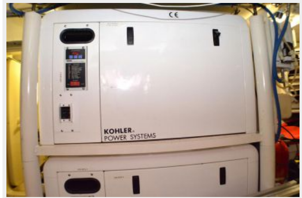
50 CY & 60 CY Frequency Converter