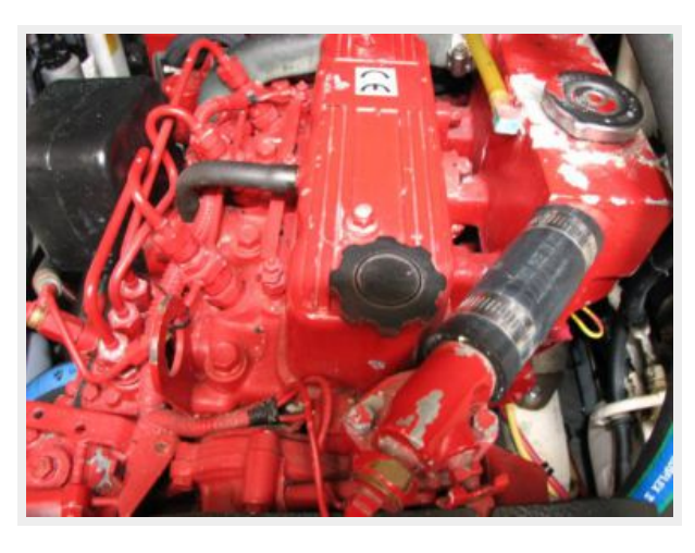
Electrical System / Equipment - Generator