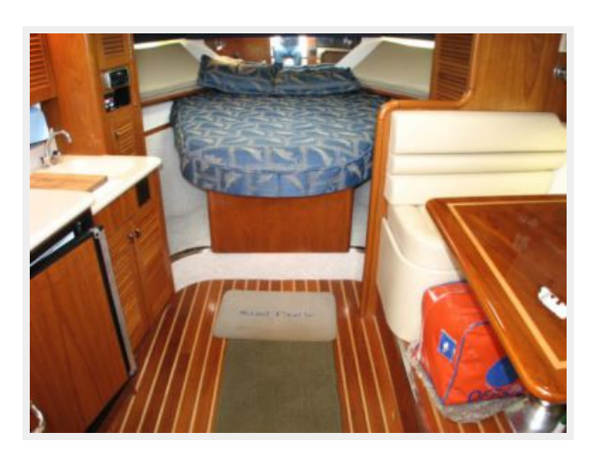
Main Cabin 1