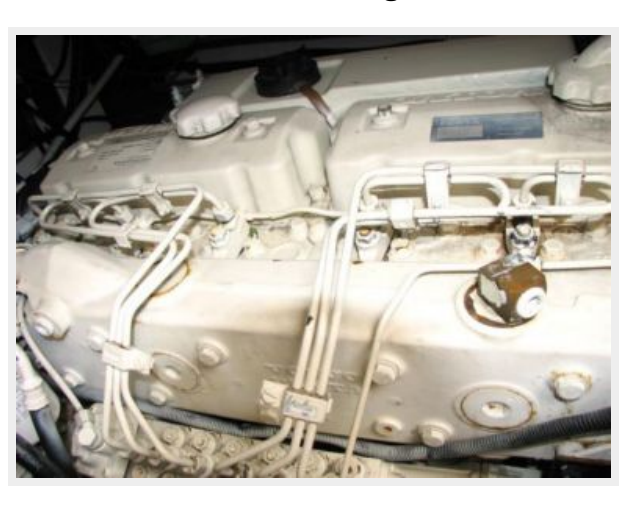
Engine & Mechanical Equipment 2 - Starboard Engine