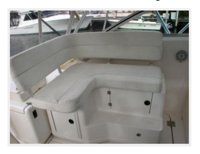
Deck 3 - Port Helm Seating