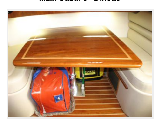
Main Cabin 3 - Dinette