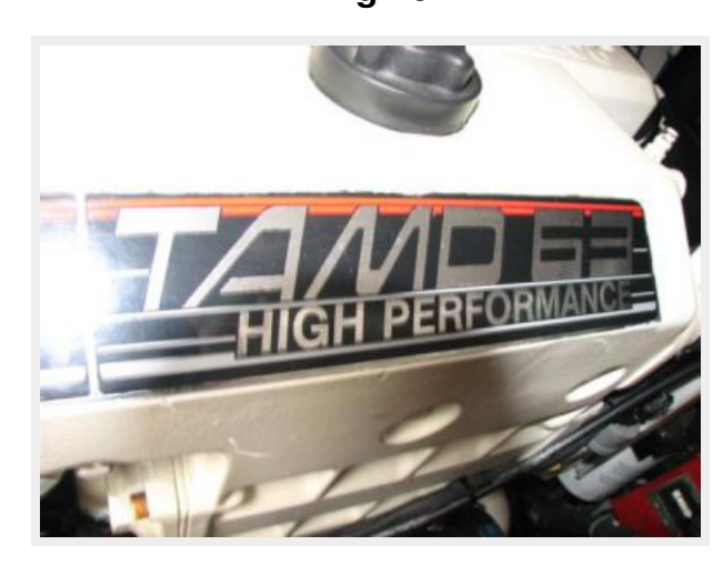
Engine & Mechanical Equipment 1 - Port Engine