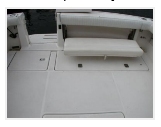
Cockpit 1 - Seating