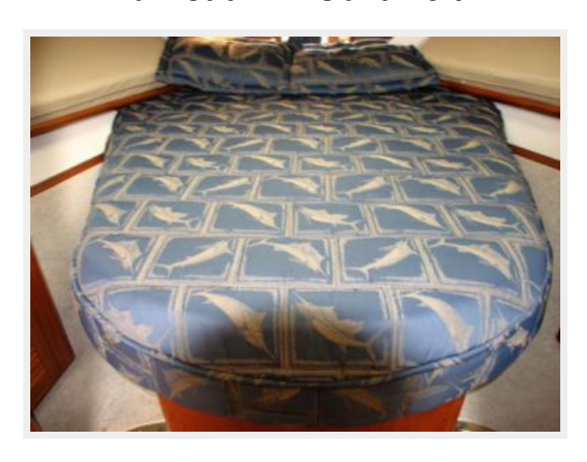
Main Cabin 2 - Island Berth