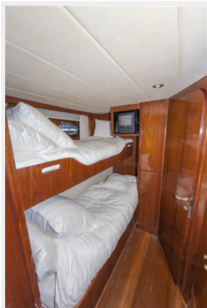
Stbd Guest Stateroom