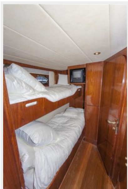
Stbd Guest Stateroom