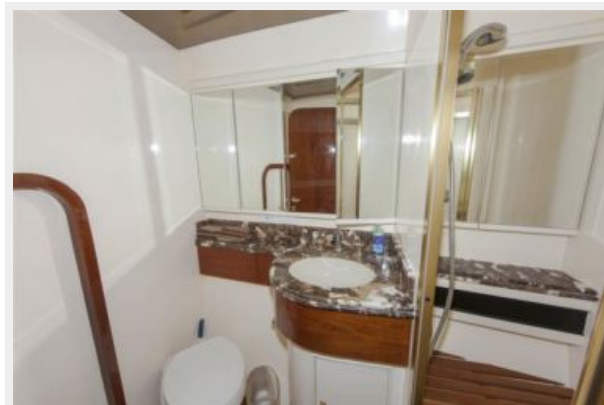
Port Guest Head