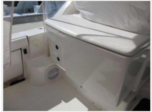
Storage & Live Well