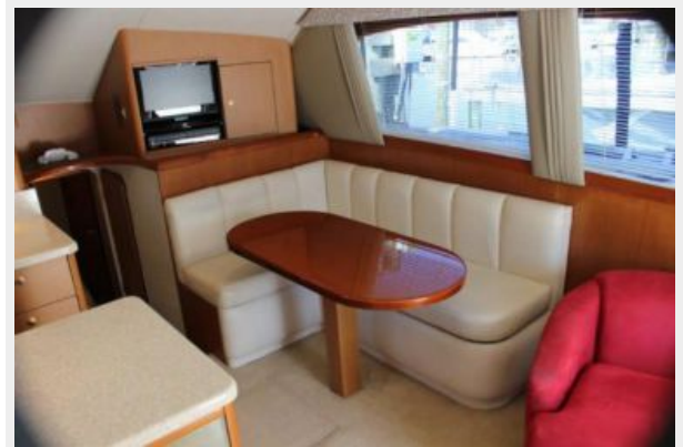
Salon 5 - Dinette