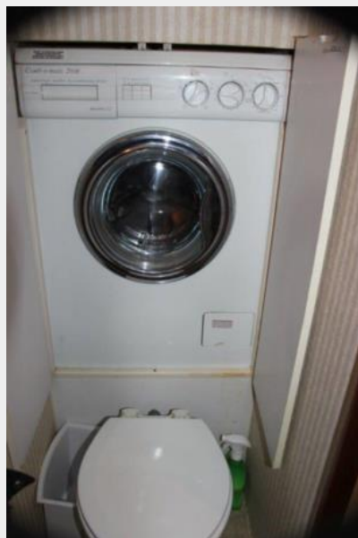
Laundry - Clothes Washer / Dryer Combo Unit