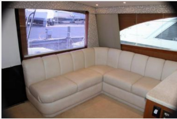
Salon 2 - Sofa