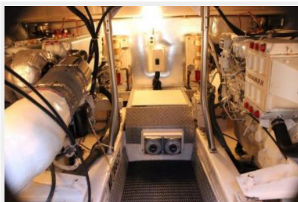
Engine & Mechanical Equipment 1 - Engine Room