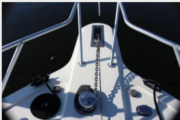
Deck 2 - Windlass