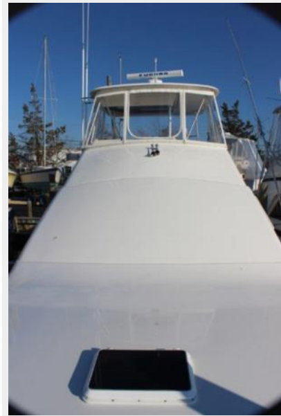
Deck 3 - View Aft