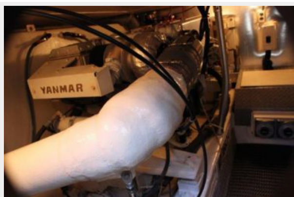
Engine & Mechanical Equipment 2 - Port Engine