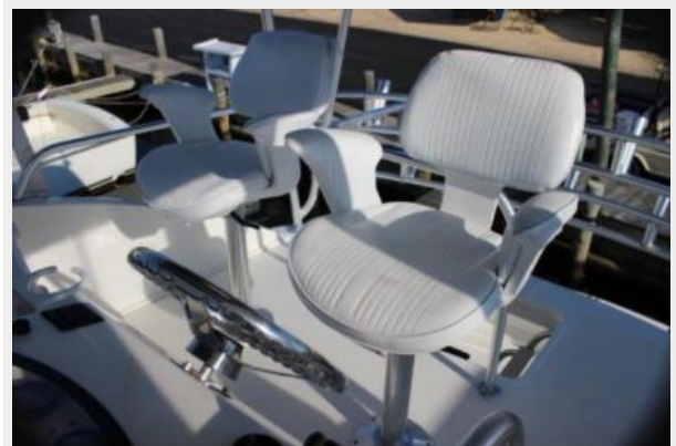
Deck 5 - Helm Seats