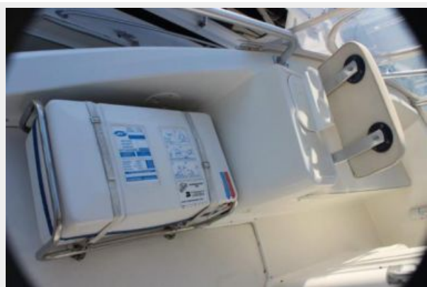
Deck 8 - Life Raft