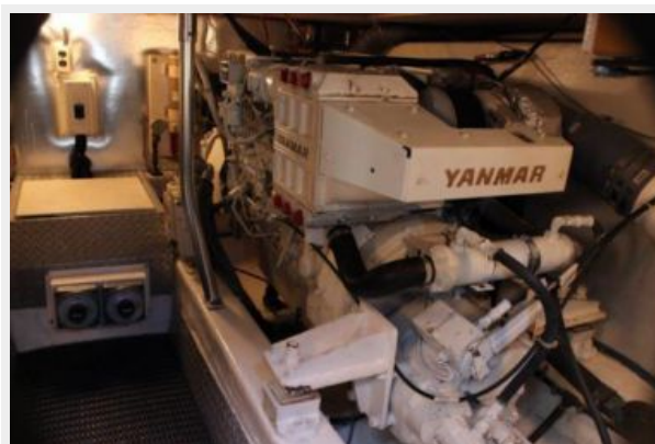
Engine & Mechanical Equipment 3 - Starboard Engine