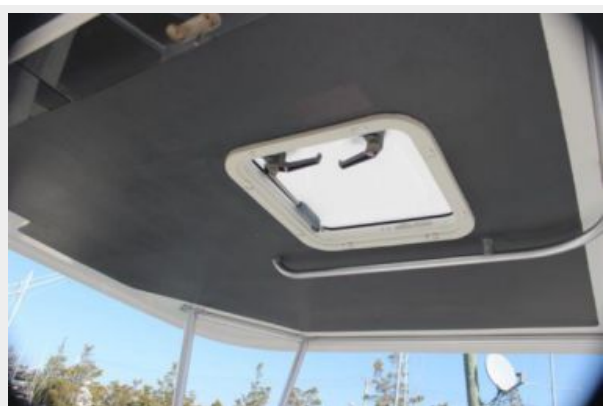
Deck 4 - Hardtop Hatch