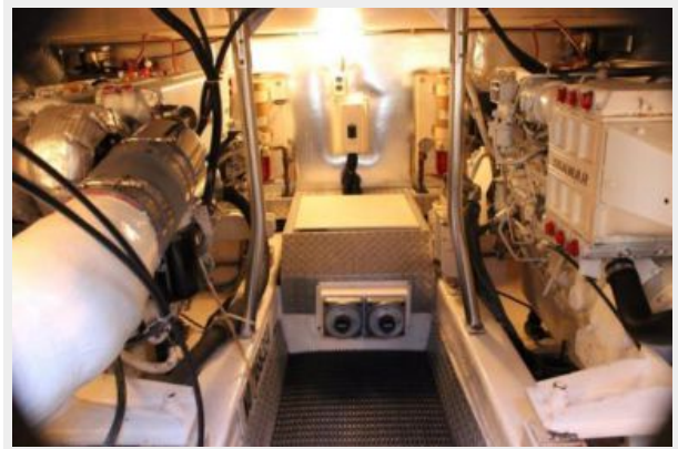
Engine & Mechanical Equipment 1 - Engine Room