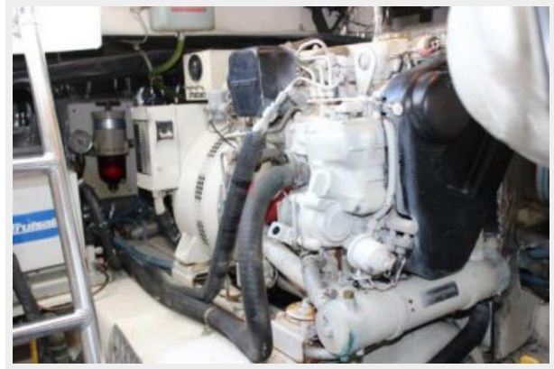
Engine & Mechanical Equipment 7 - Engine Room