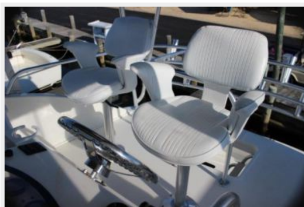
Deck 5 - Helm Seats