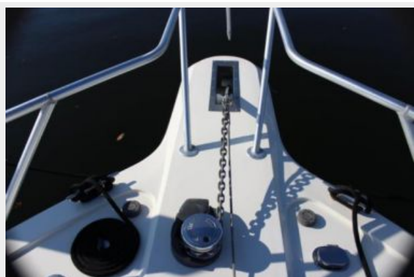
Deck 2 - Windlass