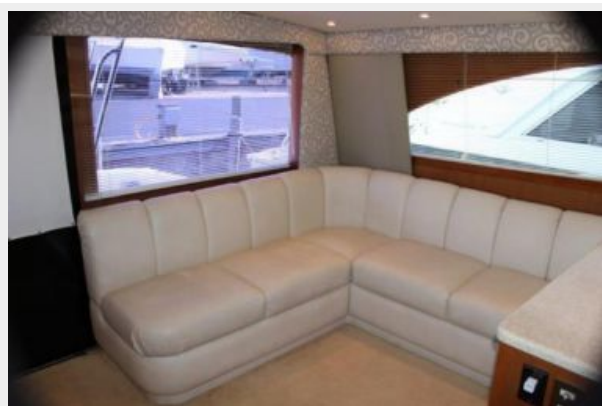
Salon 2 - Sofa