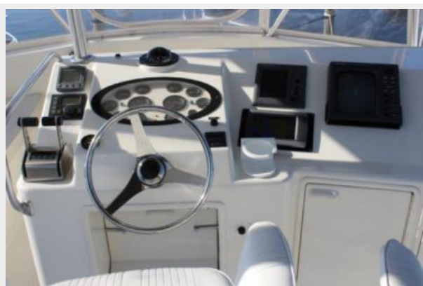
Helm / Electronics & Navigation 2