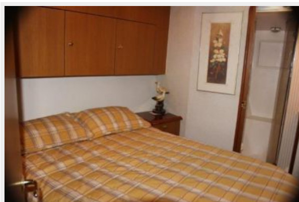
Master Stateroom 1