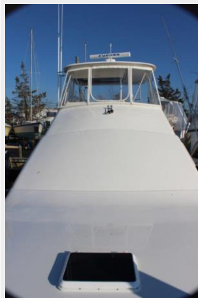
Deck 3 - View Aft