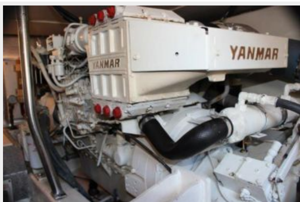
Engine & Mechanical Equipment 4 - Starboard Engine