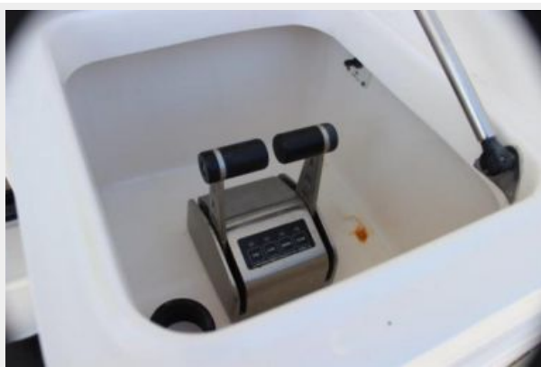
Helm / Electronics & Navigation 8 - Cockpit Controls