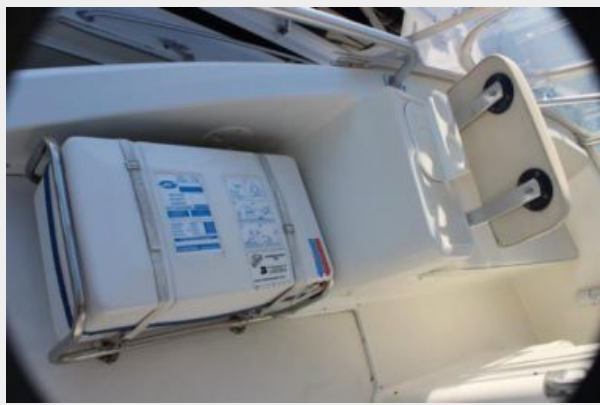
Deck 8 - Life Raft