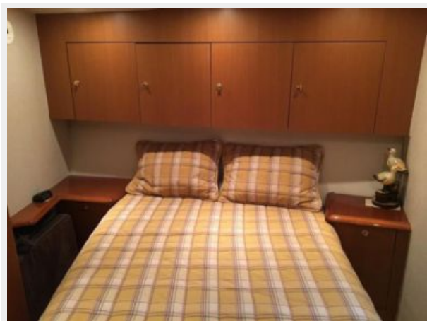
Master Stateroom 2