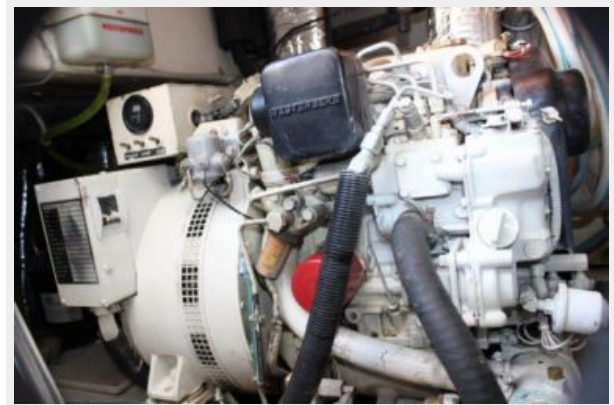
Electrical System / Equipment - Generator