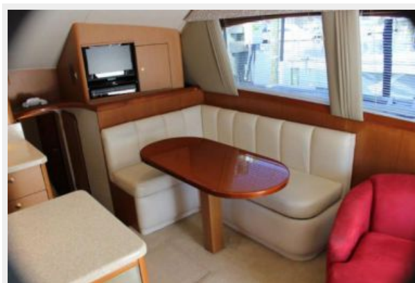
Salon 5 - Dinette