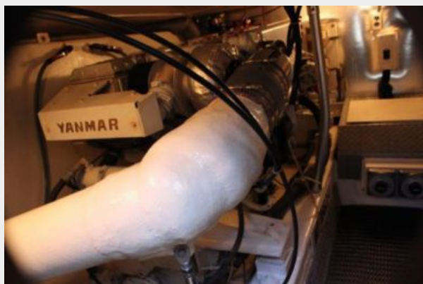
Engine & Mechanical Equipment 2 - Port Engine