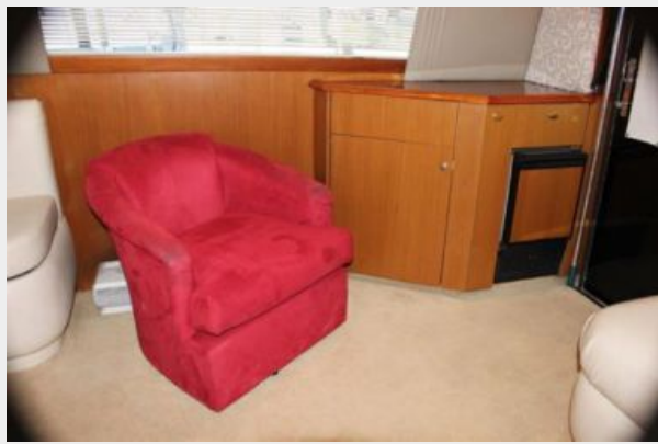
Salon 8 - Barrel Chair