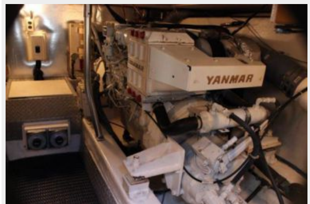
Engine & Mechanical Equipment 3 - Starboard Engine