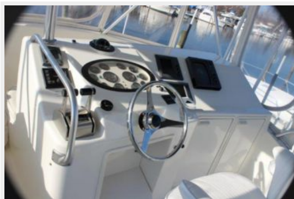
Helm / Electronics & Navigation 1