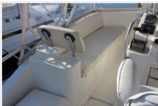
Deck 6 - Port Side Bridge Seating