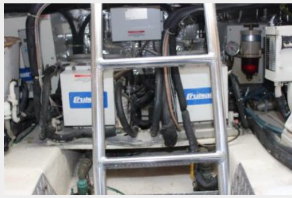
Engine & Mechanical Equipment 6 - Engine Room