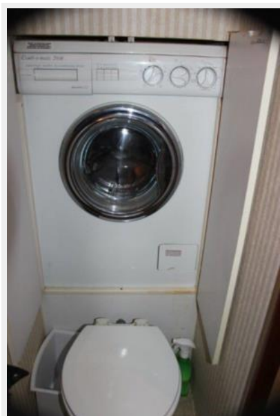
Laundry - Clothes Washer / Dryer Combo Unit