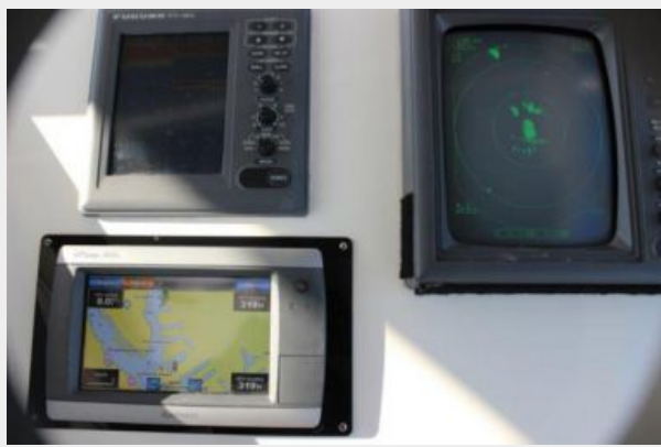
Helm / Electronics & Navigation 6 - Electronics