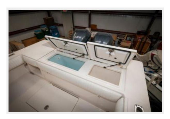
Transom Livewell and Cooler