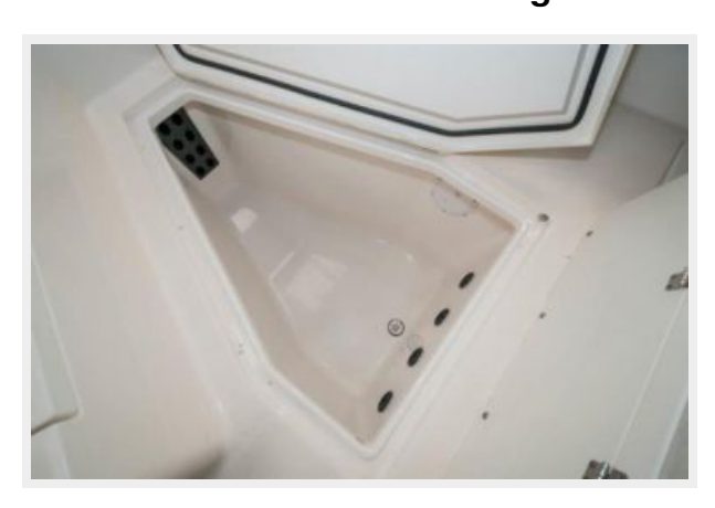
Fishbox and rod Storage