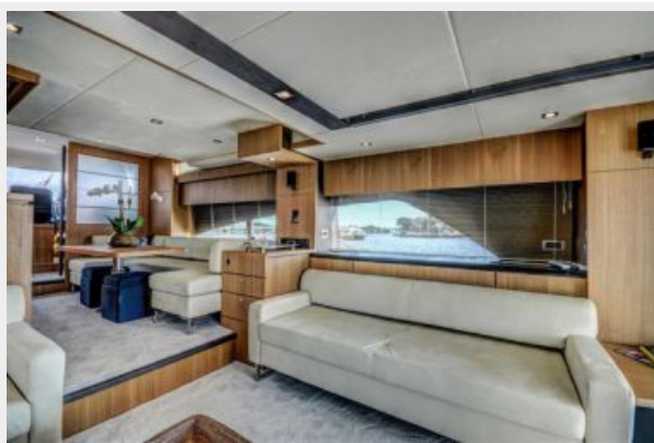
Main Salon / Dinette