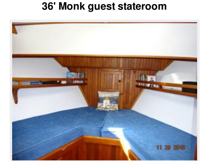
36' Monk guest stateroom starboard