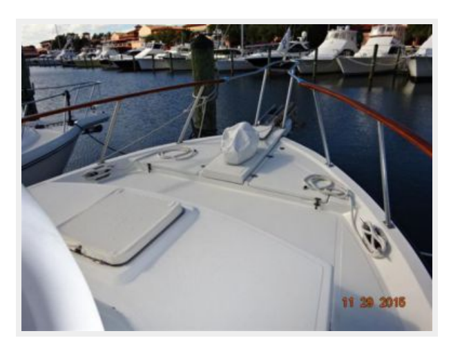
36' Monk foredeck