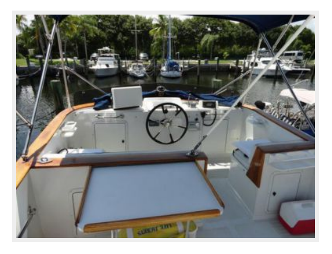
36' Monk flybridge forward