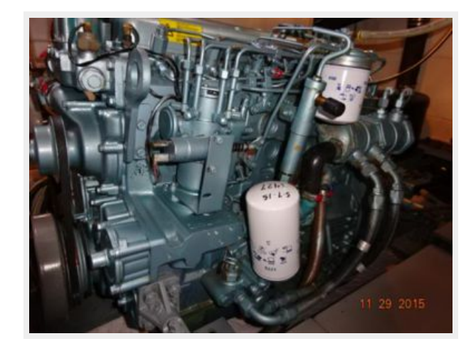
36' Monk main engine photo2