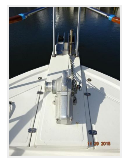
36' Monk anchor windlass