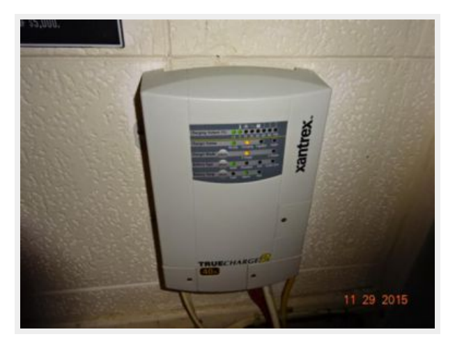
36' Monk battery charger1