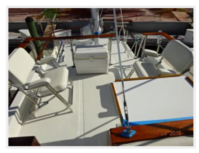
36' Monk flybridge aft