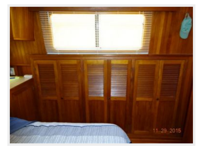
36' Monk master stateroom port