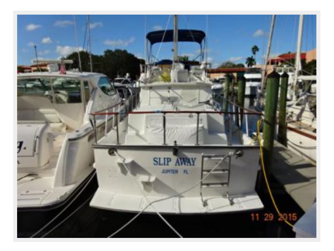
36' Monk aft profile