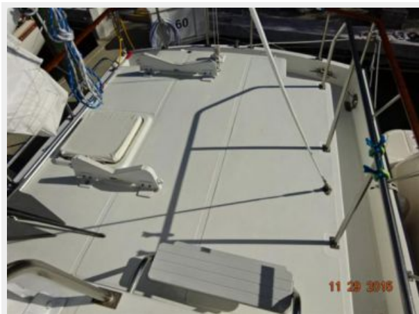
36' Monk trunk cabin aft