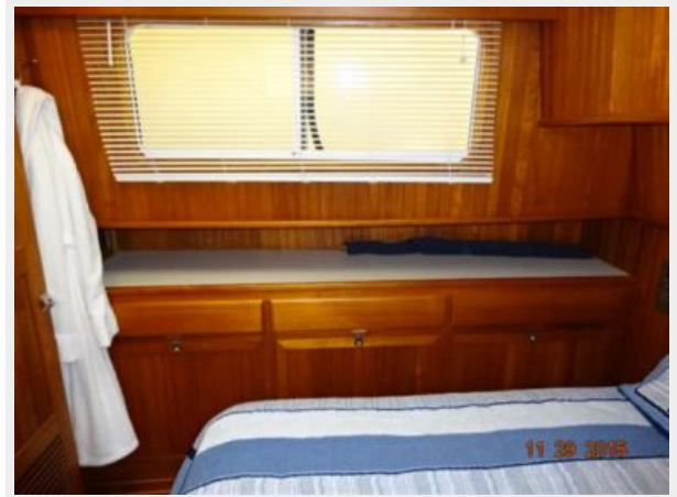
36' Monk master stateroom starboard