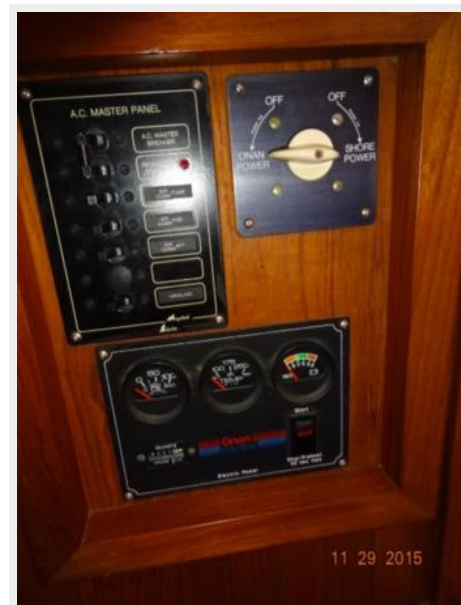
36' Monk electrical panel2