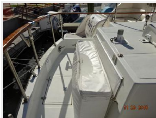
36' Monk cockpit port