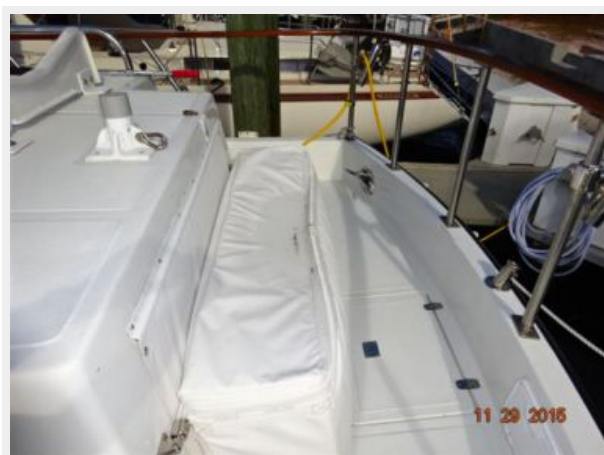
36' Monk cockpit starboard