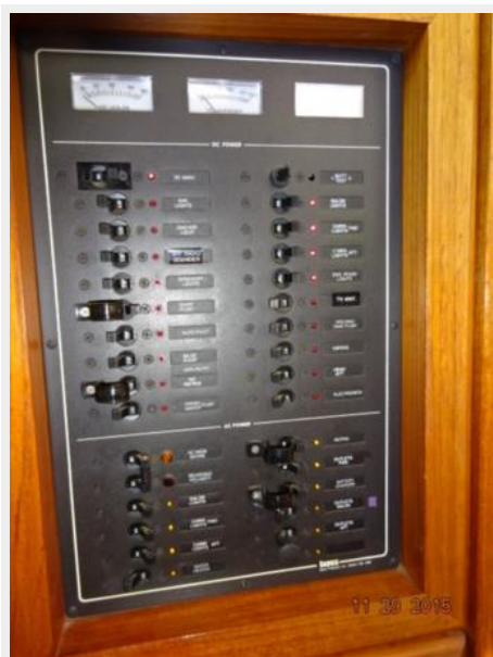
36' Monk electrical panel1