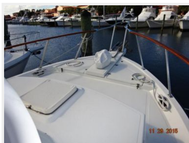
36' Monk foredeck