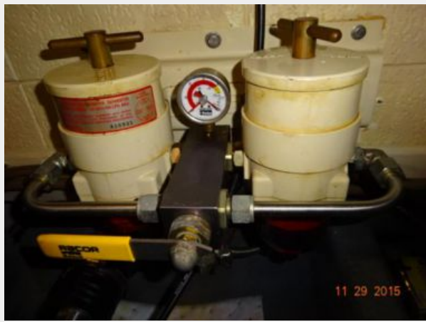
36' Monk Racor fuel filters