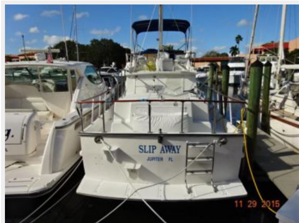
36' Monk aft profile