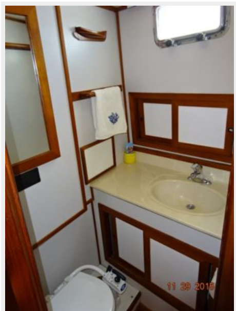
36' Monk guest stateroom head