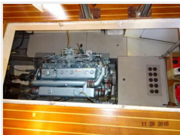
36' Monk engine room access