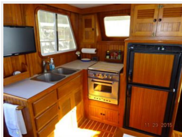
36' Monk galley