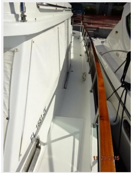
36' Monk port side deck photo1