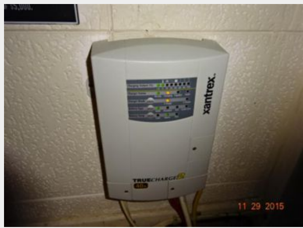
36' Monk battery charger1