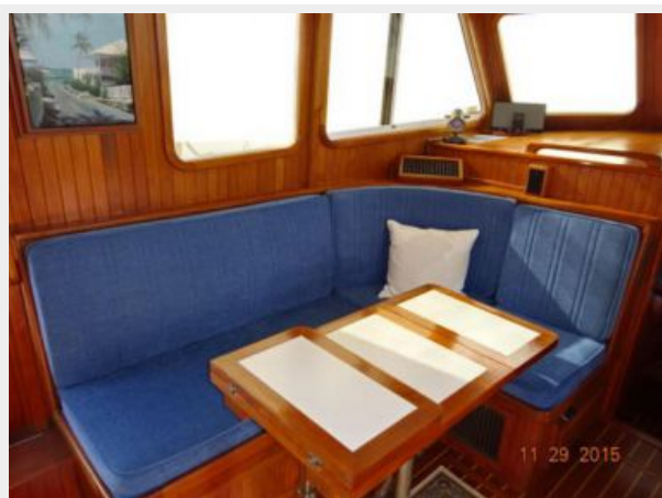
36' Monk salon seating