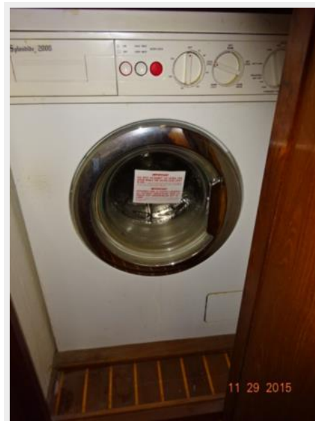
36' Monk washer-dryer