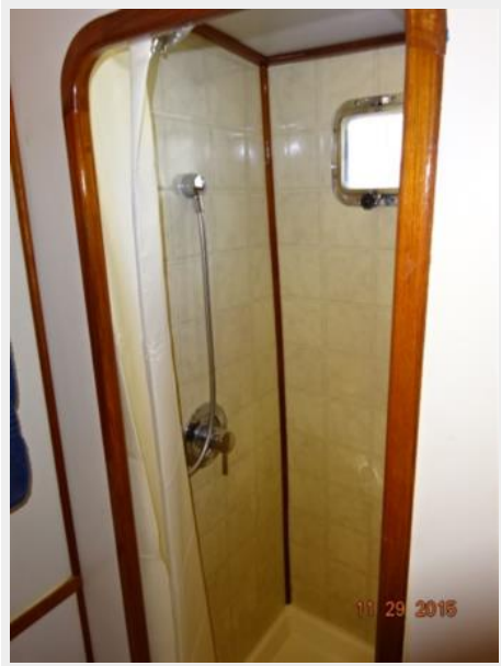
36' Monk master stateroom shower