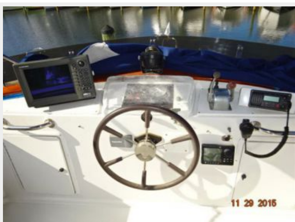
36' Monk flybridge helm