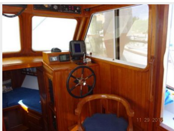
36' Monk lower helm