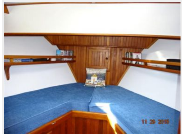
36' Monk guest stateroom