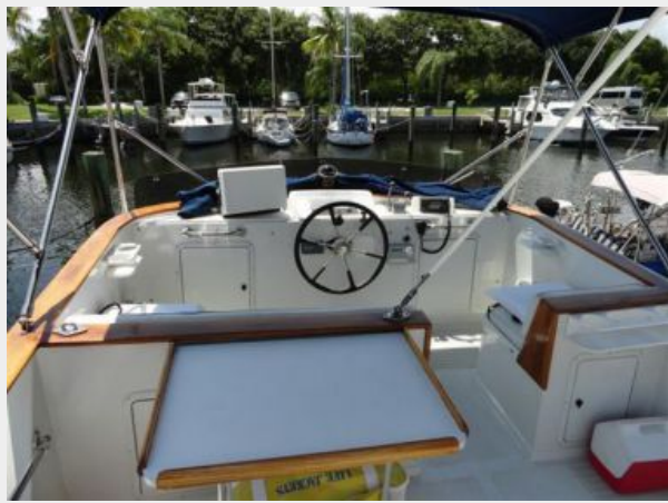
36' Monk flybridge forward