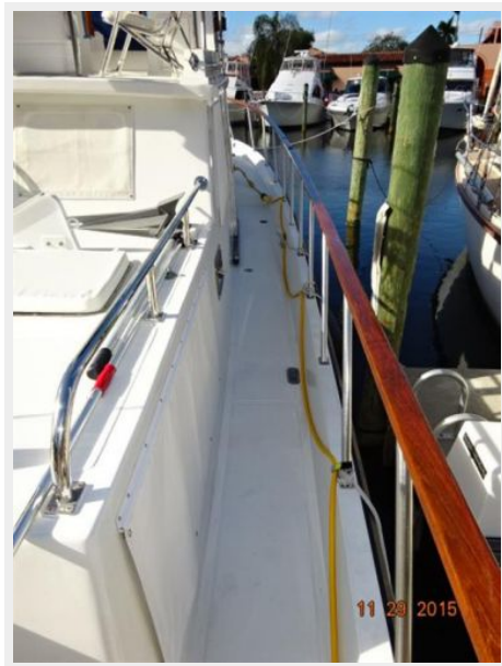
36' Monk starboard side deck photo1