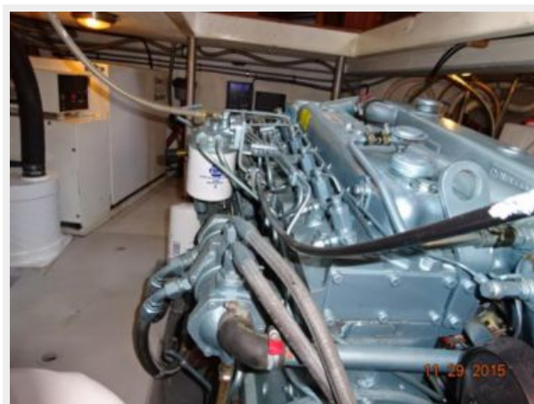
36' Monk engine room forward