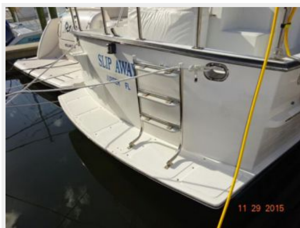
36' Monk swimplatform