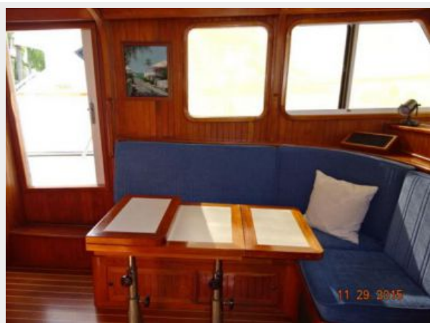
36' Monk salon port