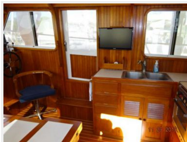
36' Monk salon starboard