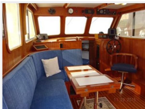
36' Monk salon forward