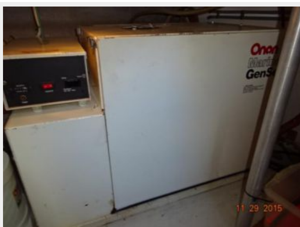
36' Monk generator soundbox