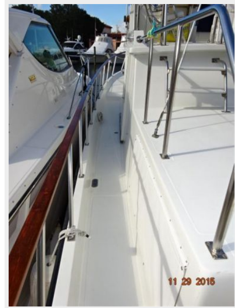
36' Monk port side deck photo2