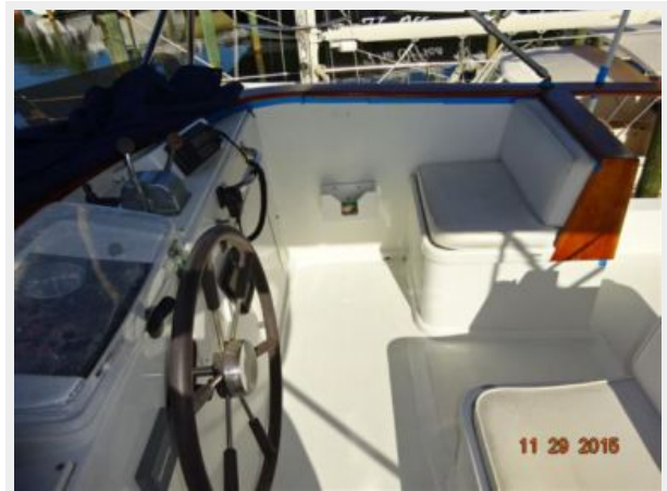
36' Monk flybridge starboard