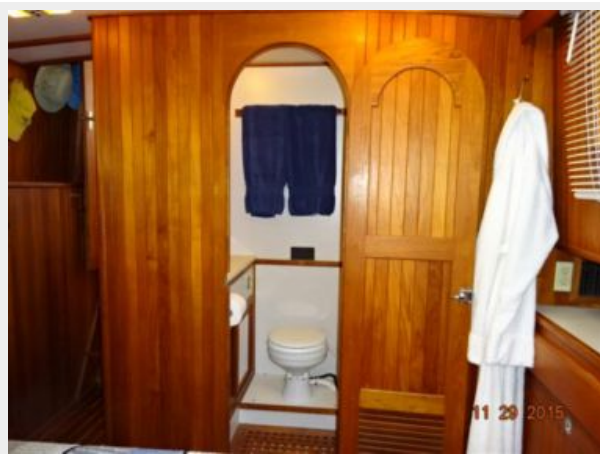
36' Monk master stateroom forward