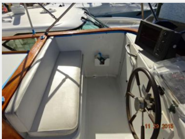
36' Monk flybridge port