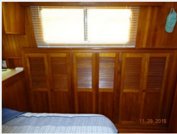
36' Monk master stateroom port