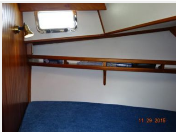
36' Monk guest stateroom port