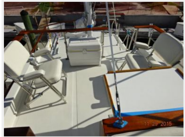
36' Monk flybridge aft