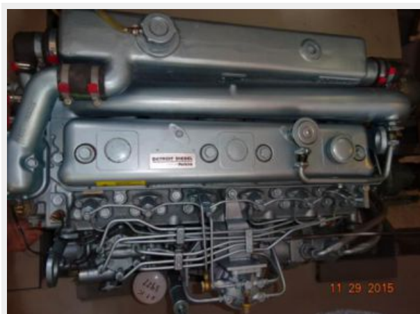
36' Monk main engine photo1