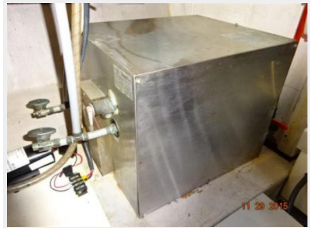
36' Monk water heater