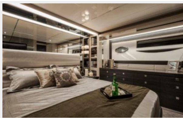
Master Stateroom II