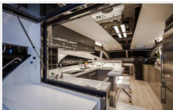
Main Deck View