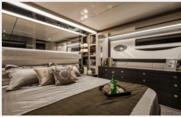
Master Stateroom II