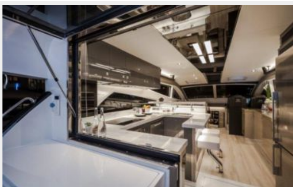
Main Deck View