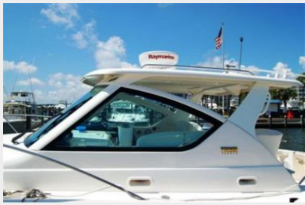
Hardtop Port View