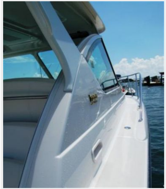
Walkway to Bow