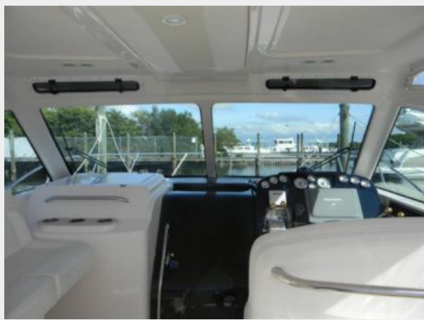
Hardtop with Vents