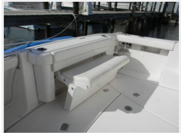
Fold Away Transom Bench Seat