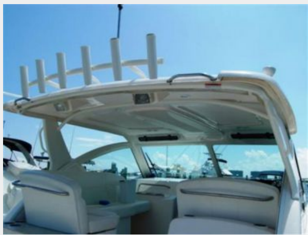
Hardtop with Custom powder Coated Rocket Launchers