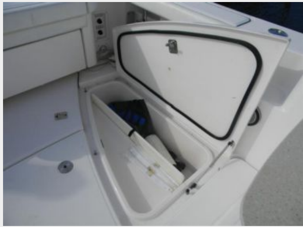
Fish Box Storage