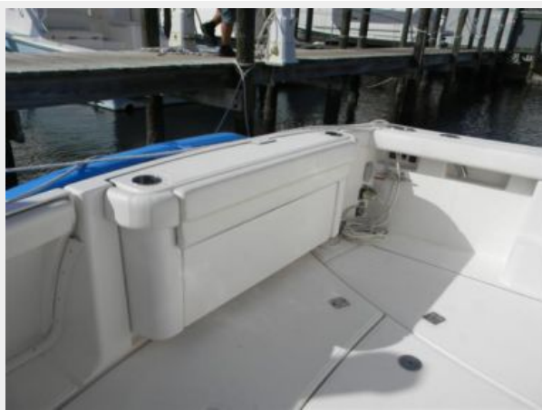
Transom Seat - Folded Away