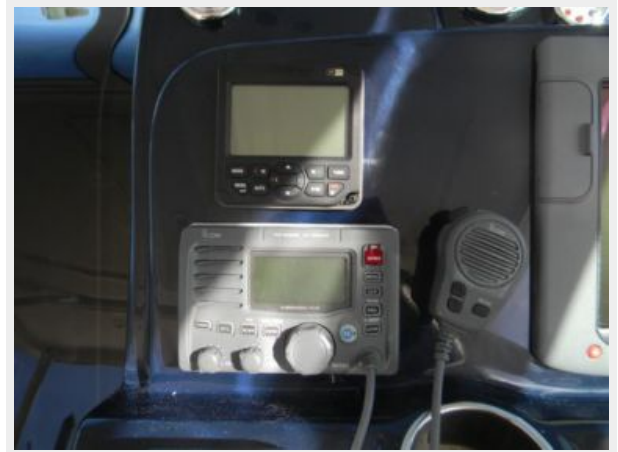
Autopilot & VHF Radio