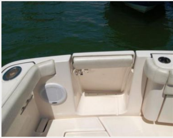
Transom Door to Swim Platform