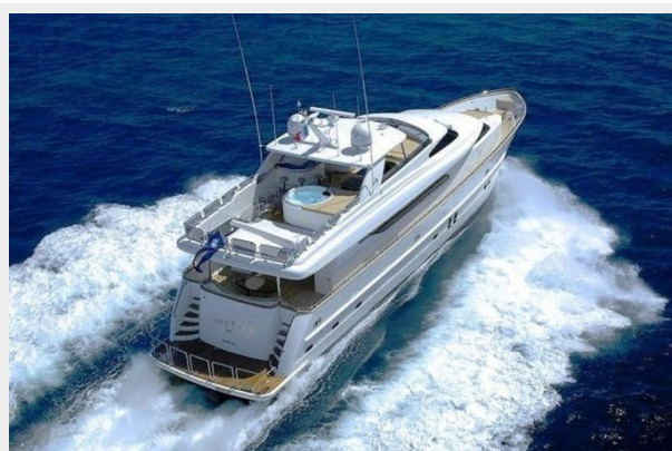
Horizon Elegance 97 Raised Pilot House - WIDE BODY