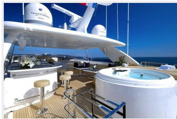
Horizon Elegance 97 Raised Pilot House - WIDE BODY