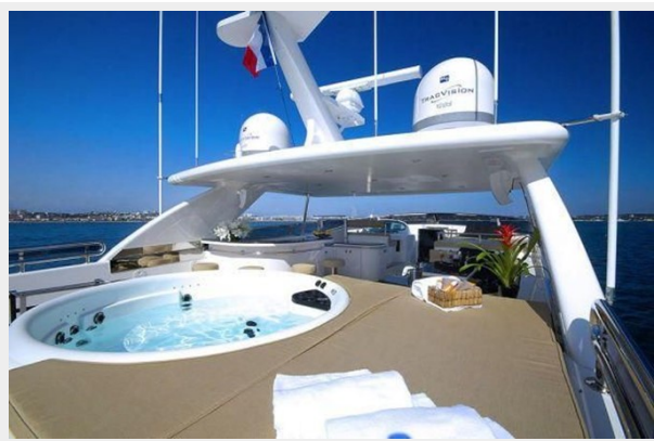
Horizon Elegance 97 Raised Pilot House - WIDE BODY