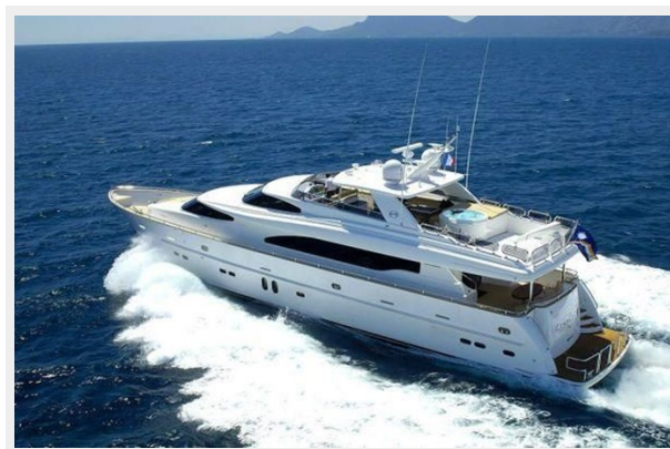
Horizon Elegance 97 Raised Pilot House - WIDE BODY