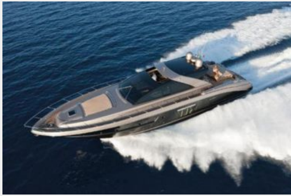
Riva 68' EGO SUPER Running Shot