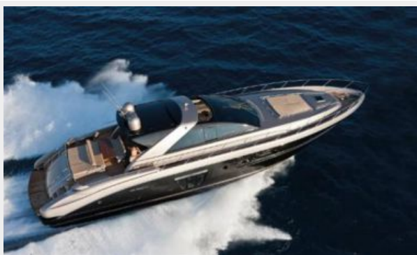
Riva 68' EGO SUPER Cruising