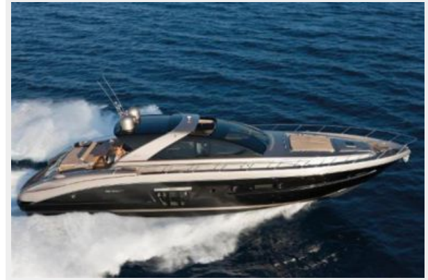
Riva 68' EGO SUPER Stern