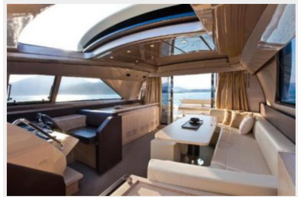
Manufacturer Provided Image: Riva 68' EGO SUPER Interior Manufacturer Provided Image: Riva 68' EGO SUPER Seating