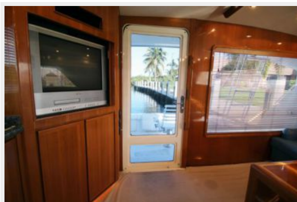
Entrance from Cockpit