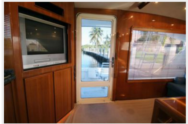
Entrance from Cockpit