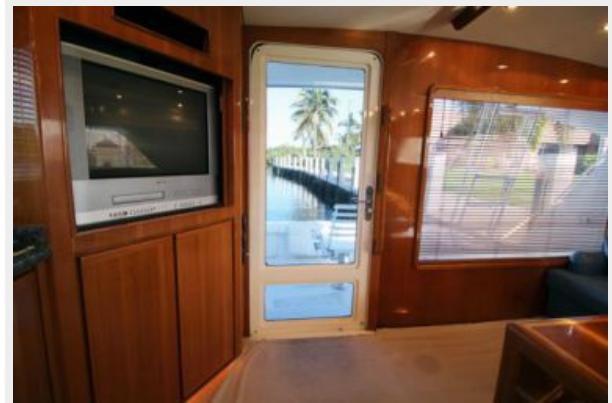
Entrance from Cockpit