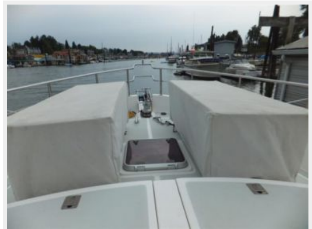
Forward to Bow