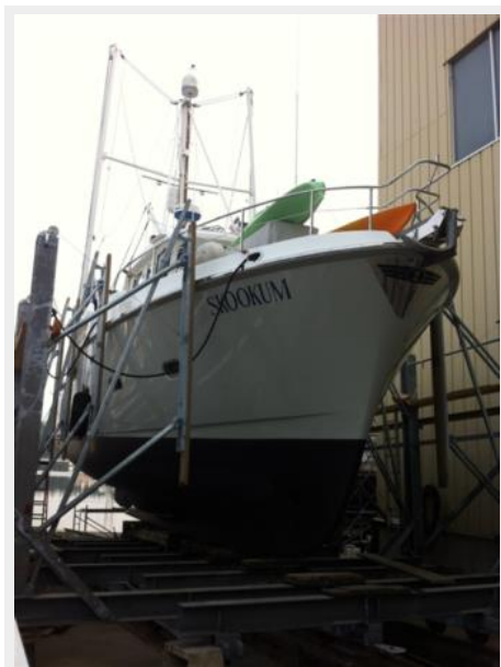
Hauled out Bow