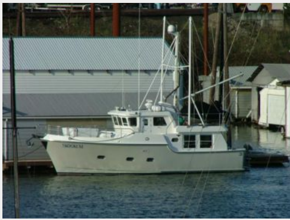
At the Dock