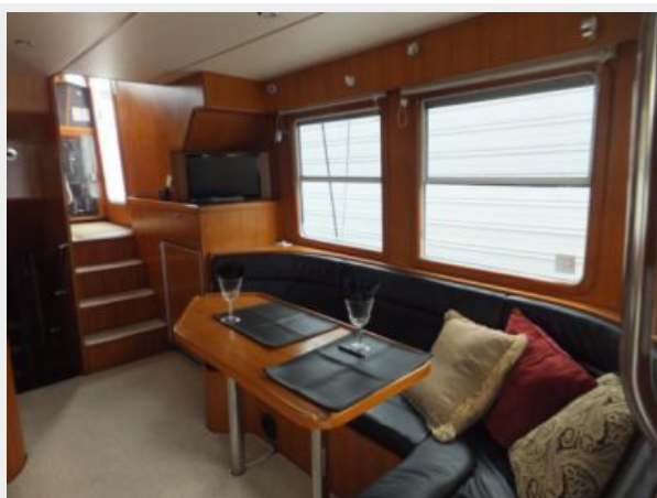
Saloon to Starboard forward