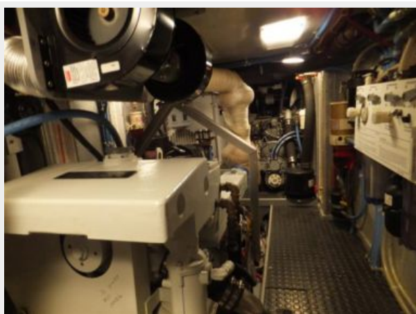
Engine room aft