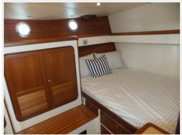
Guest Cabin to Port