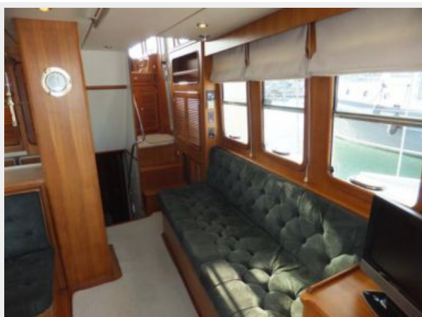
Saloon to Starboard