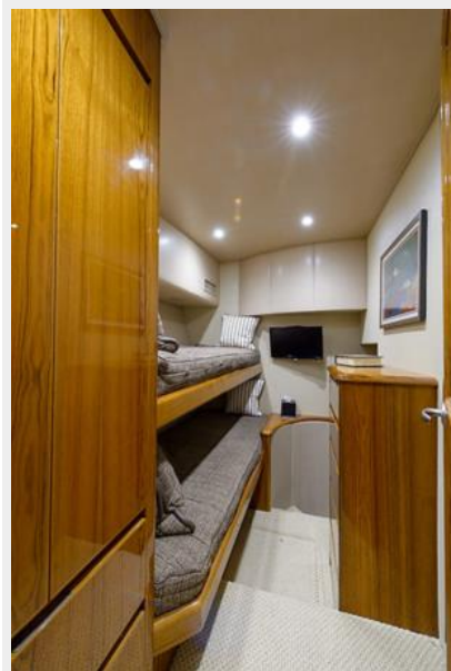
Aft Starboard Guest Stateroom