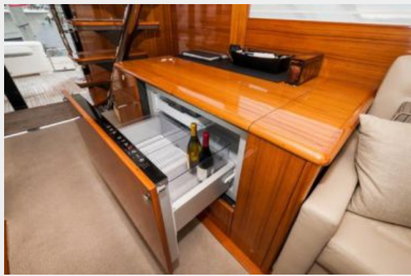
Sub Zero Fridge