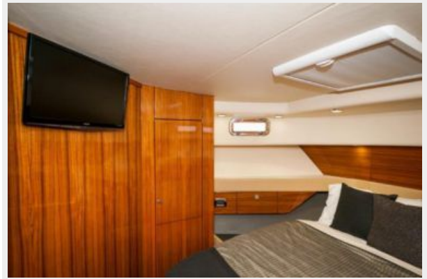
VIP Stateroom TV