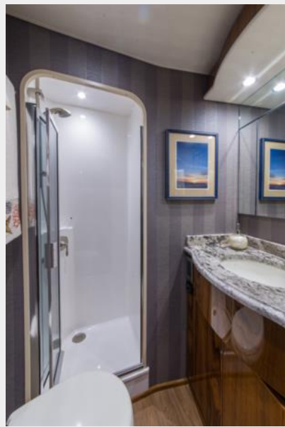
Forward Guest Head