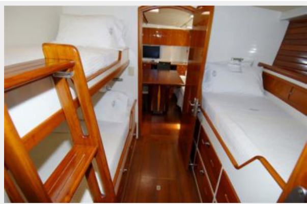
Starboard guest cabin looking aft