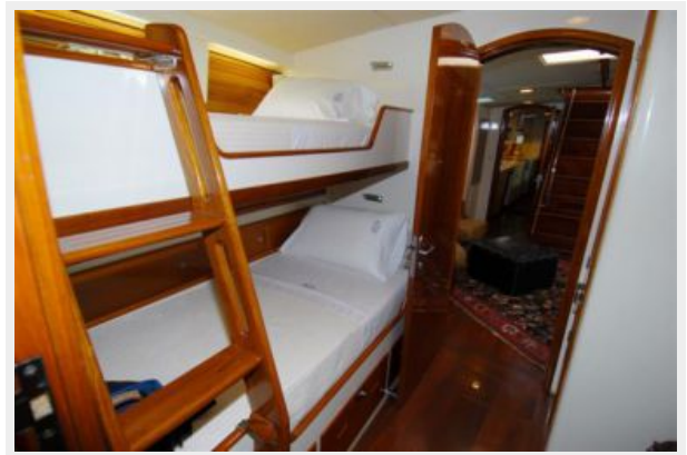
Port guest cabin looking aft