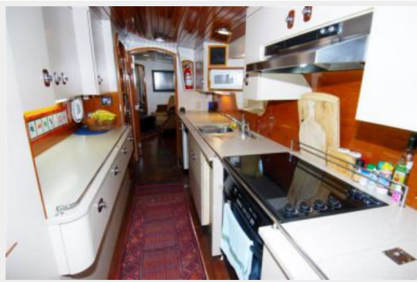
Galley looking forward