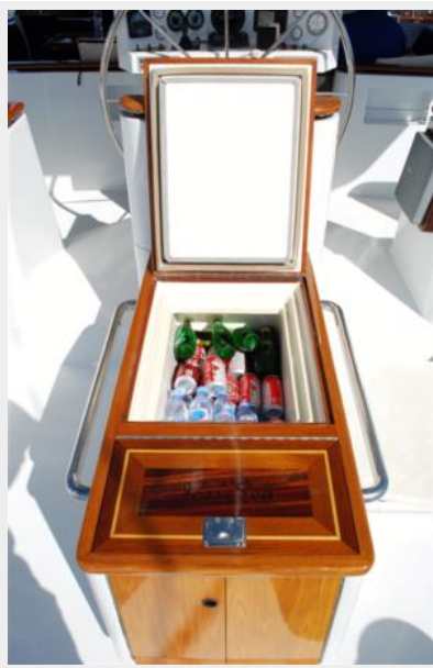
Cockpit cold drink locker just behind aft steering station