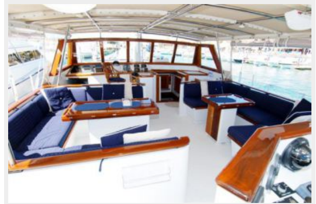
Cockpit looking forward