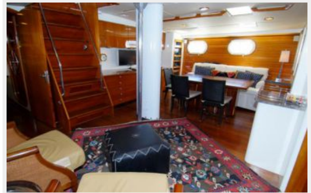
Salon looking aft to port