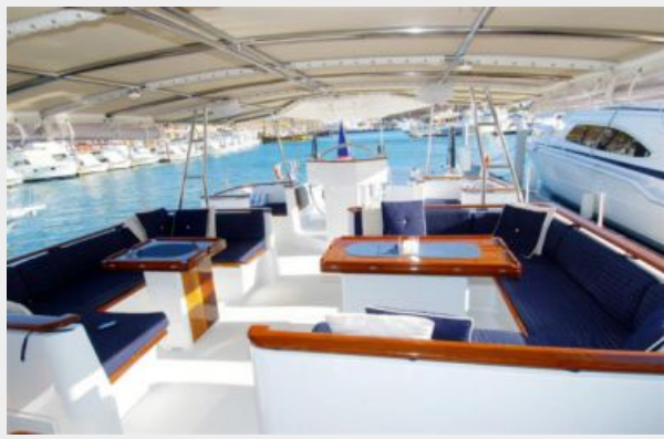
Cockpit looking aft