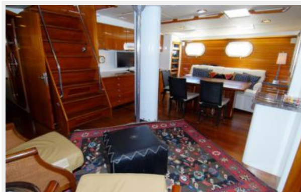
Salon looking aft to port