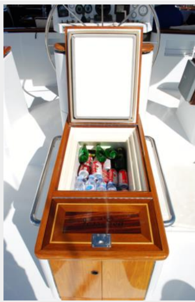
Cockpit cold drink locker just behind aft steering station