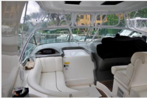
Bridge Deck Port Side