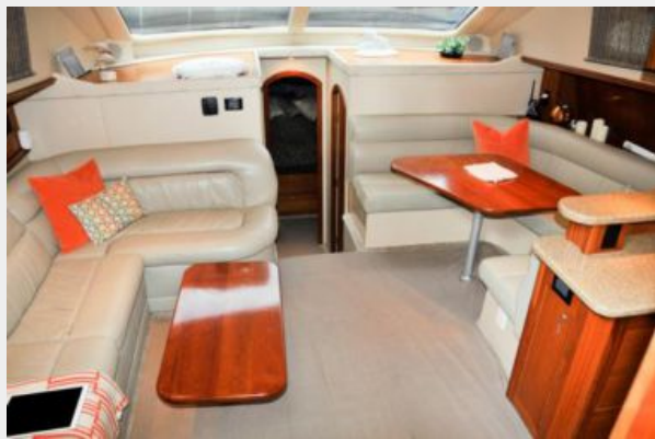
Main Salon Overview