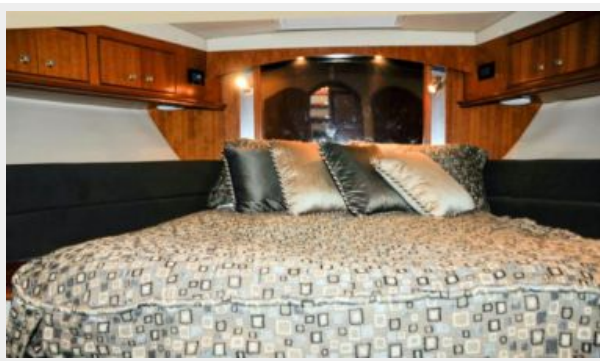
VIP Guest Stateroom Forward