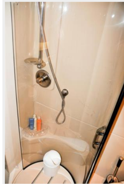
VIP Guest Stateroom Shower