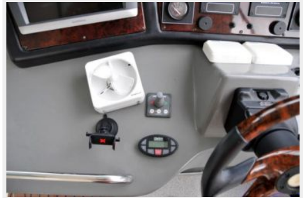
Bridge Deck Helm