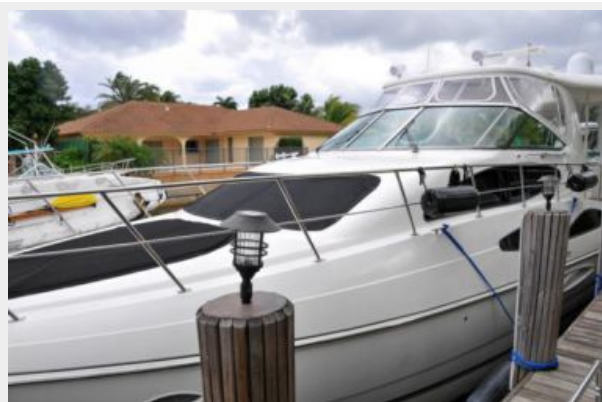
Port Side Profile