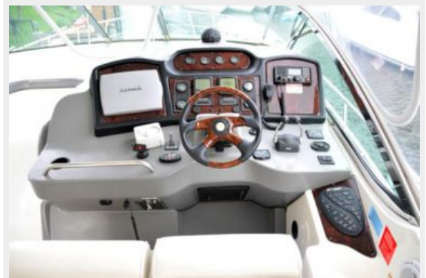
Bridge Deck Helm