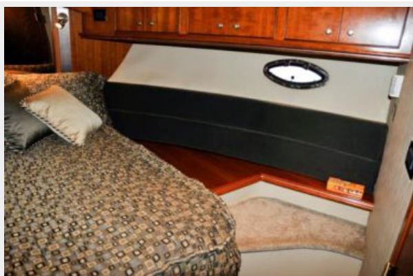
VIP Guest Stateroom 3