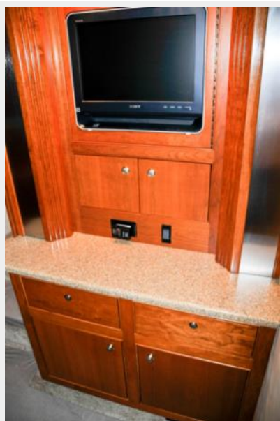
Master Stateroom Entertainment