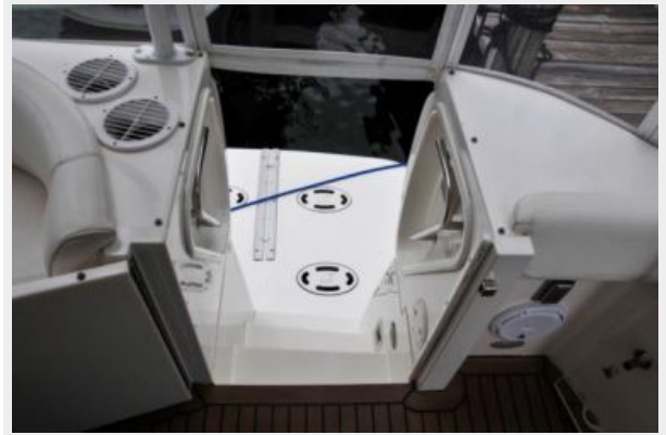
Bridge Deck Swim Platform Access