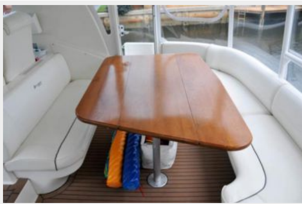
Bridge Deck Table