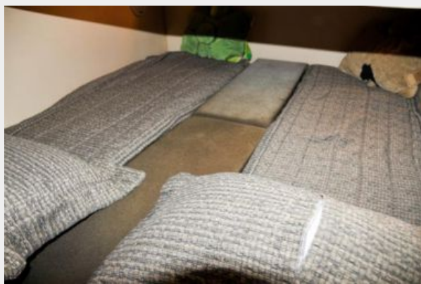
Guest Stateroom 3