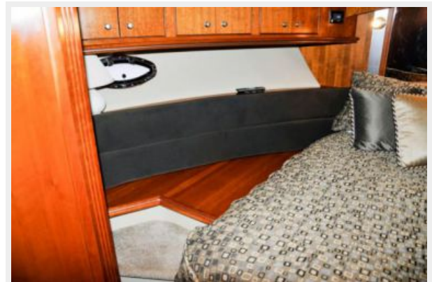
VIP Guest Stateroom 2