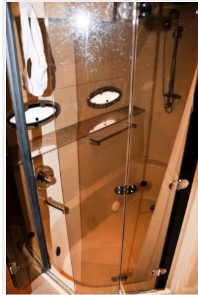
Master Stateroom Shower