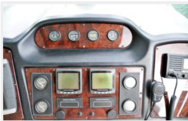
Bridge Deck Instrumentation