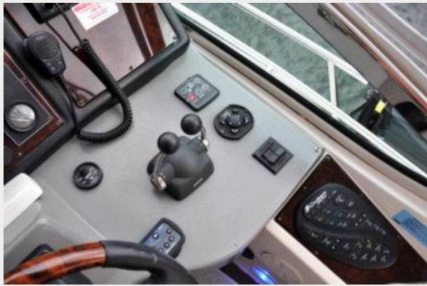
Bridge Deck Helm Controls