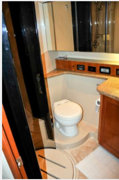
VIP Guest Stateroom Head & Shower