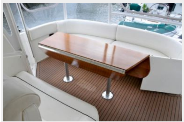
Bridge Deck Table Folded