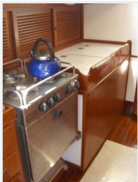
Galley View 3