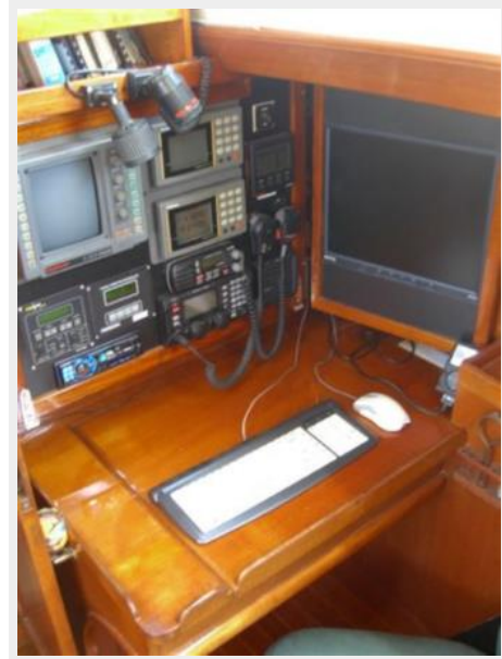
Nav Station View 1