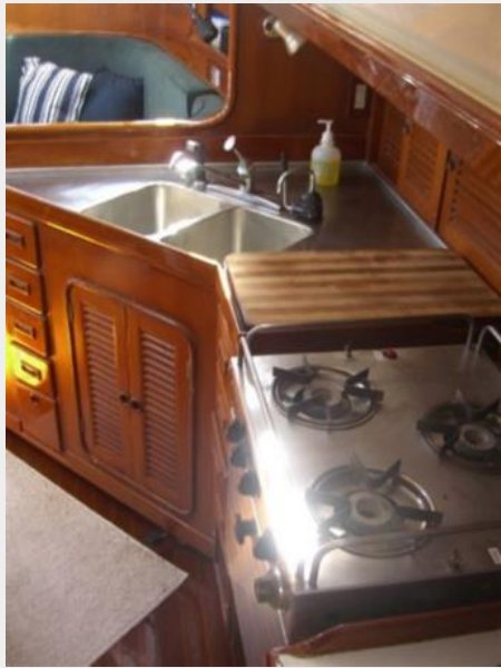
Galley View 2