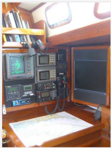
Nav Station View 2