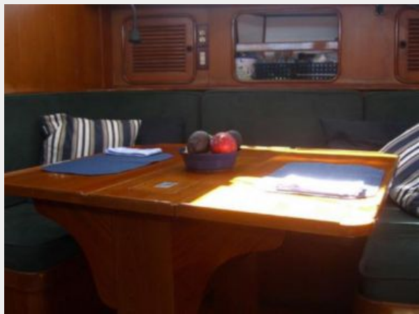
Salon Dining Table and Seating