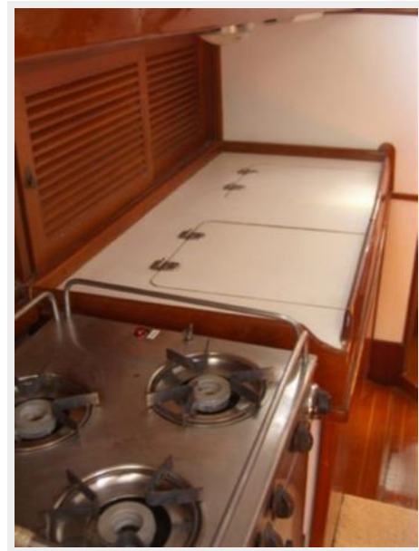
Galley View 2