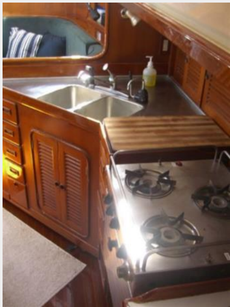
Galley View 1 Stainless Sink, Counter and Stove