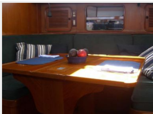
Salon Dining Table and Seating