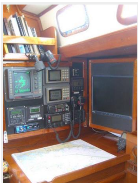
Nav Station View 2