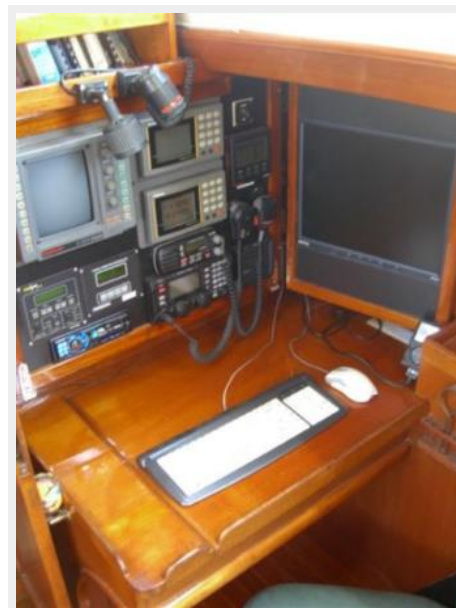
Nav Station View 1