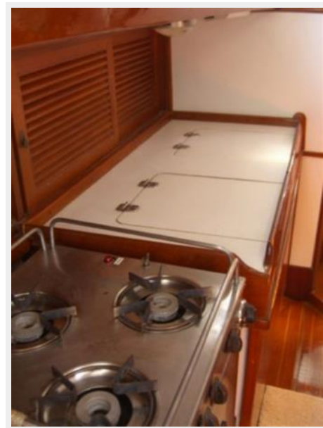
Galley View 2